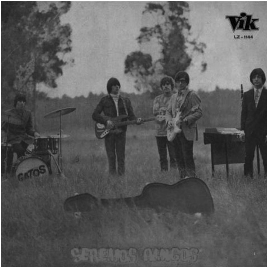
Figure 3: Los Gatos, Seremos Amigos , RCA, 1968.

uninhabited space. This choice differed from the preference of many other young people, especially those connected with militant politics, for the northern regions of Argentina. This wish to know the 'deep hinterland' was linked to the aspirations for change held by various political organizations. In their eyes, these places were proof of the difficult life that many Argentines endured daily. But the young rockers were not very interested in the modalities of social transformation espoused by militant youth. Although they shared in the general idea that change was imminent, their proposal consisted of an inner, individual search which could potentially affect one's surroundings. So, instead of choosing the northern provinces with their baggage of history and social significance, they opted for a southern 'vacuum', lacking in traditions, which they could access with nothing more than a train ticket to embark on a new lifestyle in the country's most virgin wilderness.