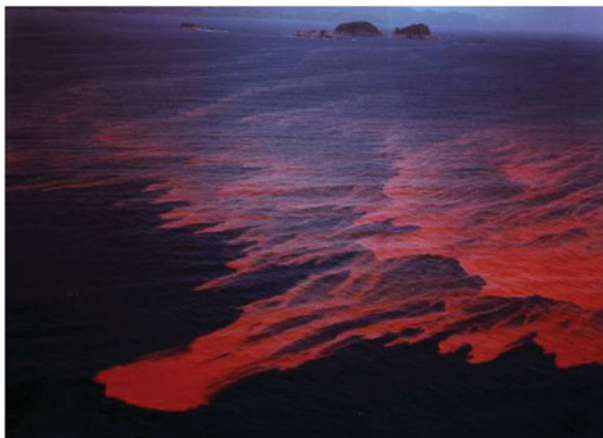
Fig. 1. A dramatic algal bloom (red tide) in the South China Sea. This bloom, Noctiluca scintillans , was non-toxic. (Reproduced with permission of Springer SBM NL. In: Okaichi T, Fukuyo Y, eds. Red Tides , Berlin, Heidelberg: Springer, 2004.)

new analytical methods have been developed for the determination of toxins in shellfish, especially liquid chromatography–mass spectrometry (LC–MS). These methods have recently been reviewed and will not be discussed in detail [4]. The European Food Standards Agency has recently published a scientific opinion on marine biotoxins with proposals to lower some toxin limits and other measures that will hasten the replacement of mouse bioassay (MBA) methods that have traditionally been used to monitor toxin levels in shellfish for human consumption [5]. Unfortunately, the lack of clinical testing methods has led to a large underestimation of the incidence of human poisonings due to algal toxins, especially since many of the symptoms are similar to viral and bacterial infections. In addition, only acute intoxications due to algal toxins are recognized and there is very little knowledge of the human impacts due to chronic exposure to these toxins. The high potency and target specificity that many of these marine toxins possess has led to their exploitation as research tools [6].