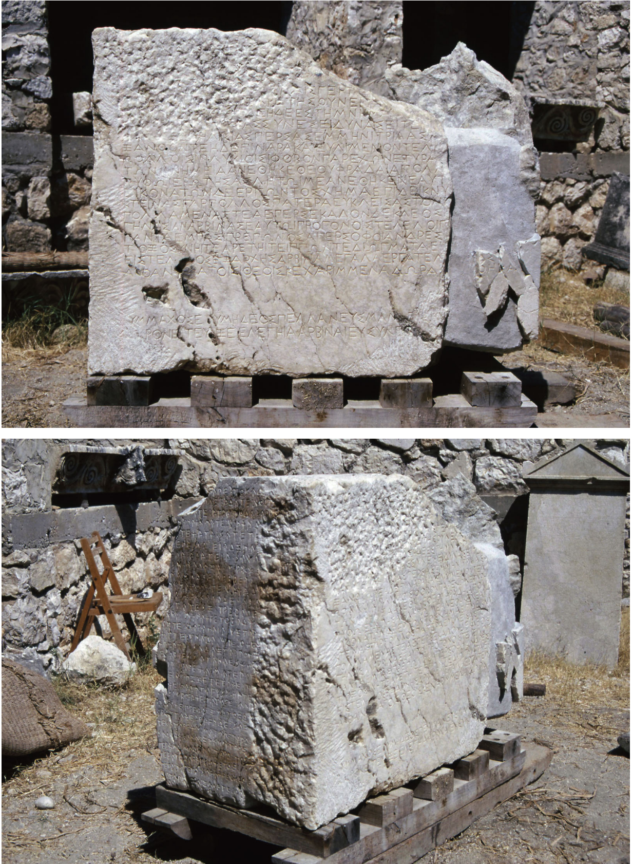
Figure 4. The base of Erbinnna dedicated to the Letoon, inv. 6121, after FdX 9: pls 72–73. Top: Face A, with Greek epigram by poet Symmachos; bottom: Wide side, Face A and narrow side, Face D, inscribed with Lycian.