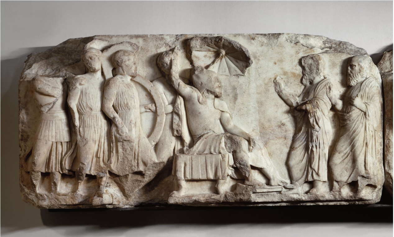
Figure 13. Detail of the enthroned dynast Erbbina receiving an audience from the upper podium frieze of the Nereid Monument. London: British Museum inv. 1848,1020.62 (© The Trustees of the British Museum).