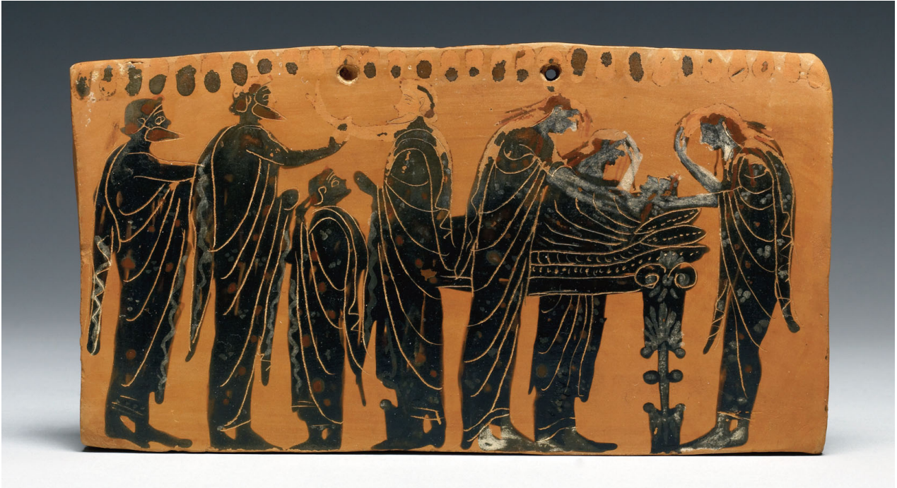
Figure 15. Black-figure pinax with funerary scene, attributed to the Gela Painter. Second half of the sixth century BCE, Attica. Terracotta. 9 x 16.8cm. The Walters Art Museum, Baltimore inv. 48.225.