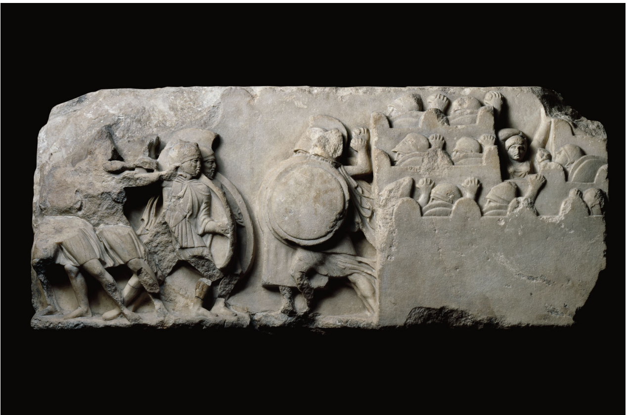
Figure 14. Detail from the city-siege reliefs of the upper podium frieze from the Nereid Monument, marble, length: 1.42m, ca 390–380 BCE. Xanthus, Lycia. London: British Museum inv 1848,1020.65 (869).