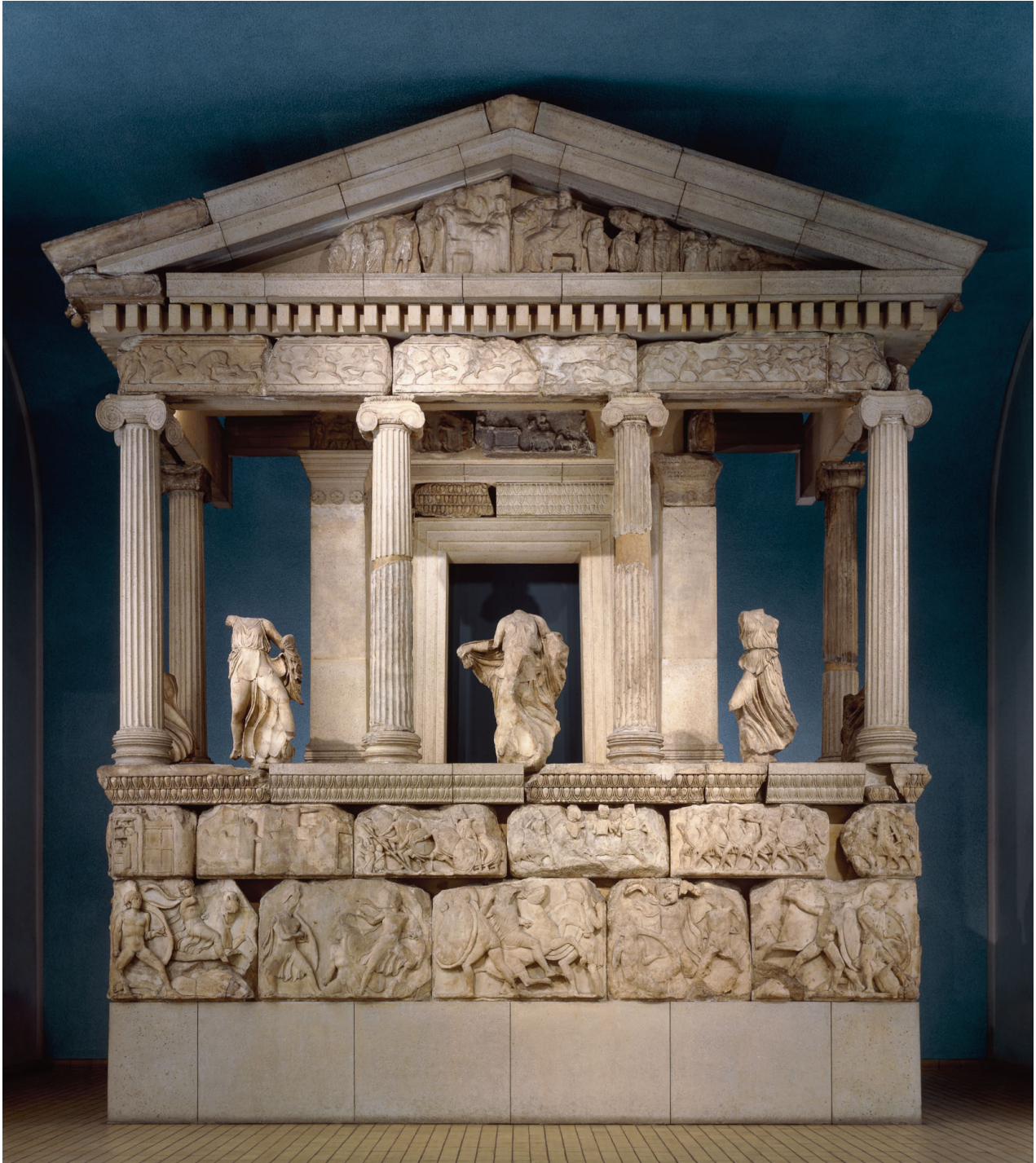
Figure 1. The Nereid Monument, or the funerary and triumphal monument of the dynast Erbbina, on display in the British Museum. Marble and limestone, ca. 390–380 BCE. Xanthos, Lycia. London: British Museum inv. 1848, 1020.81.

and marble, the monument resembles an Ionic tetrastyle, peripteral temple ( templon ), mounted on top of a high podium (approximately 6.8 x 10.17m, on the eastern and northern sides, respectively), with doors on the eastern and western sides of the tomb (see FdX 3: 31–41 for discussion of dimensions of the podium facades). Unfortunately, the original excavators did not record the precise find spots of