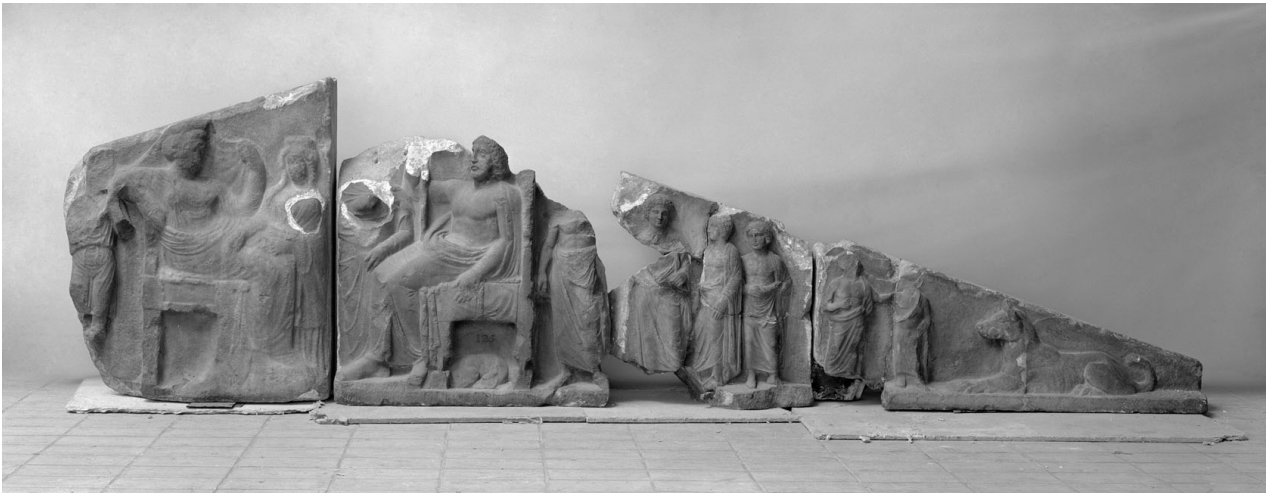
Figure 6. Detail of the east pediment from the Nereid Monument, marble, height: 0.9m, ca 390–380 BCE, Xanthus, Lycia. London: British Museum inv. 1848,1020.125.

In between the dynastic couple stand two smaller female figures wearing chitons: the figure to the right rests one of her arms on Erbbina’s lap, while the figure to the left places both of her arms on the consort’s lap. Standing on either side of the couple are more male and female figures – five behind the consort and six behind Erbbina – who are also smaller in scale compared to the couple. These standing figures are either the couple’s children or attendants, as their diminutive scale may signal their social difference in either relative status and/or age. In the right corner, another sitting dog faces the centre of the pediment. The assembly of various male and female figures on the same horizontal picture plane create an image of a dynastic court or household, and possibly even an entire dynastic family (Ridgway 1997; Jenkins 2006: 199; FdX 8: 216–20).