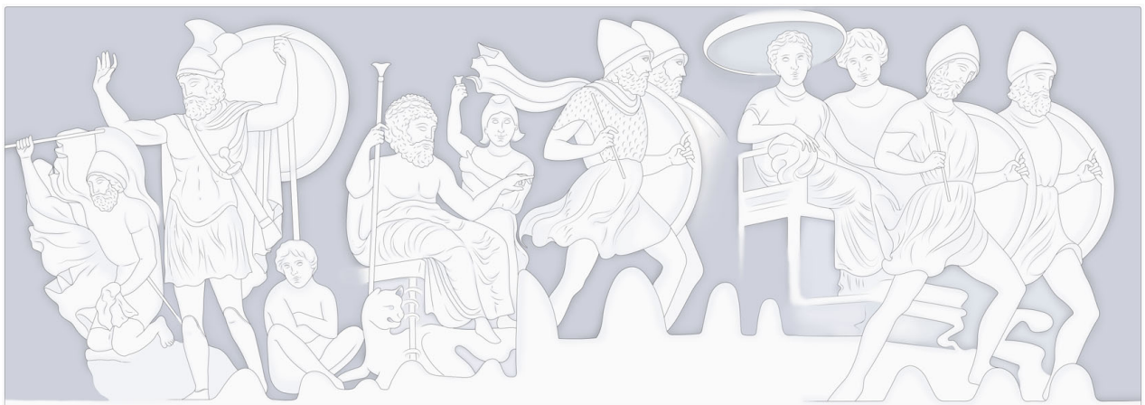
Figure 12. Drawing of dynastic couple from the west wall of the heroon of Gölbası-Trysa (by M. Grimaldi). Rights belong with the author).