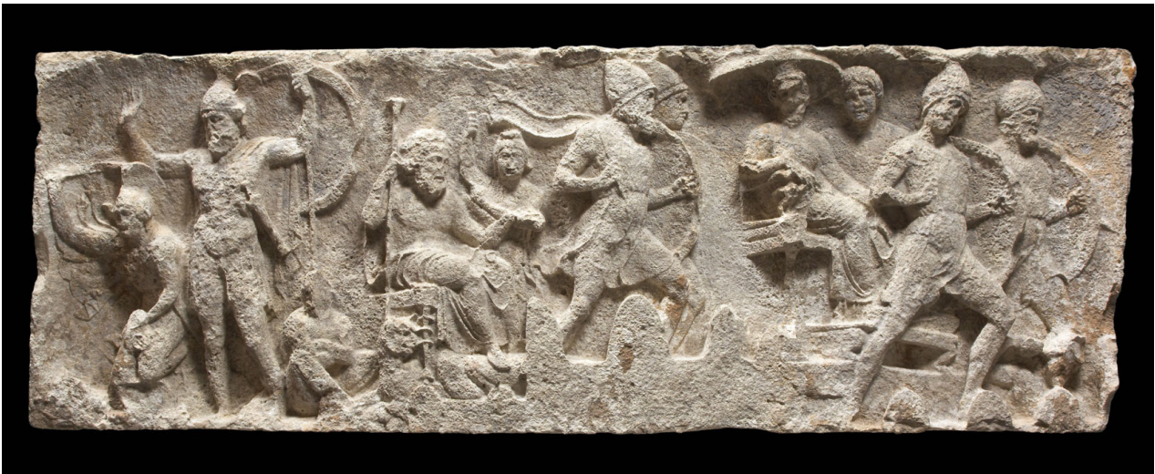
Figure 11. Detail of the dynastic couple from the west wall of the heroon of Gölbası-Trysa, ca 370. Vienna: Kunsthistorisches Museum, I 462.

donian bear hunt – with historicising, documentary friezes (Benndorf, Niemann 1889; Childs 1978: 13–14; Oberleitner 1990; 1994; Landskron 2016). The specific iconography that concerns me here can be found on the west wall: to the right of a scene in which warriors perform ritual animal sacrifices is a peculiar image of an enthroned dynastic couple and their two servants, and all four of these figures are depicted among or alongside armed soldiers running into battle (Figs 11–12). In the foreground of the relief, Lycian merlons emerge from the bottom edge of the panel, thus suggesting that the scene takes place behind city walls. The dynast is bearded and diademed, with a himation covering the lower half of his otherwise nude body. Holding a sceptre with one hand, he sits on an elaborately decorated throne with his feet on a footstool, and he is accompanied by a domesticated but fierce animal.