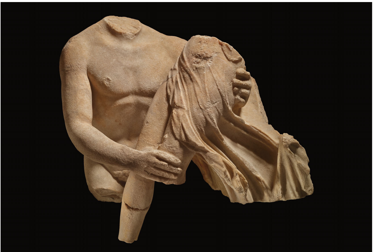
Figure 16. Acroterion from the Nereid Monument, marble, height: 87.50cm, ca 390–380 BCE. Xanthus, Lycia. London: British Museum inv. 1848,1020.134 (926).