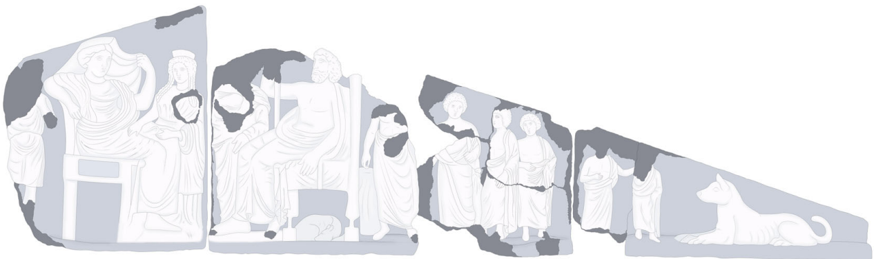
Figure 7. Drawing of the east pediment from the Nereid Monument (by M. Grimaldi. Rights belong to the author).