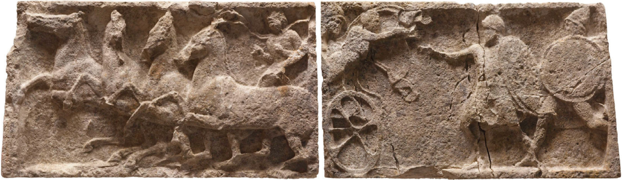
Figure 18. Detail of the abduction/rape of the Leucippides by the Dioscuri, interior north wall of the heroon from Gjolbasi-Trysa, marble, ca 370. Vienna: Kunsthistorisches Museum, I 534 and 535.

Cohen's argument is of particular importance to the Nereid Monument's upper frieze and the ways its visual programme appeals to cultural attitudes regarding the relationship between war, sexuality and gender within Lycian contexts. I reiterate here that the frieze does not present us with an abduction scene, nor do I claim that the woman signifies the 'rape of the Lycian city', as a Naglerian reading might propose. Instead, through the specificity of her pose – which emphasises her lack or loss of status, the sense of heightened trauma while under siege and the state of mourning that emerges from death – the woman portends the victory of Erbbina's troops while anticipating what might happen in the aftermath of war: she too might eventually fall prey to sexual and physical assault. However disturbing or troubling such depictions might be to our own contemporary sensibilities, such visual allusions to grief and abduction not only amplified the violence of war, they likewise appealed to the heroic manhood of Erbbina and his soldiers as brave warriors. Statements of heroic masculinity abound throughout the Nereid Monument's sculptural programme, including scenes of sacrifice and hunt, of male banqueting, of Erbbina receiving audiences underneath a parasol and, finally, of mythological abductions. All such activities and iconographies functioned as a statement of male heroics.