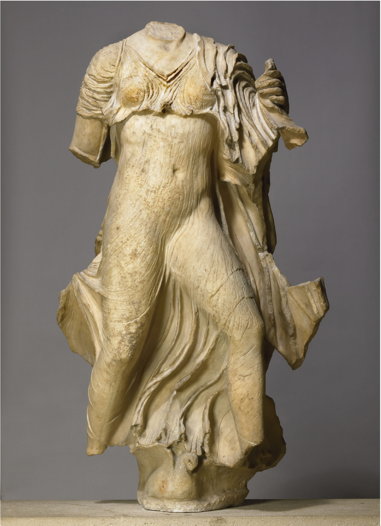
Figure 3. One of the so-called 'Nereids' from the Nereid Monument, marble, height: 1.37m, ca 390–380 BCE, Xanthus, Lycia. London: British Museum inv. 1848,1020.81.