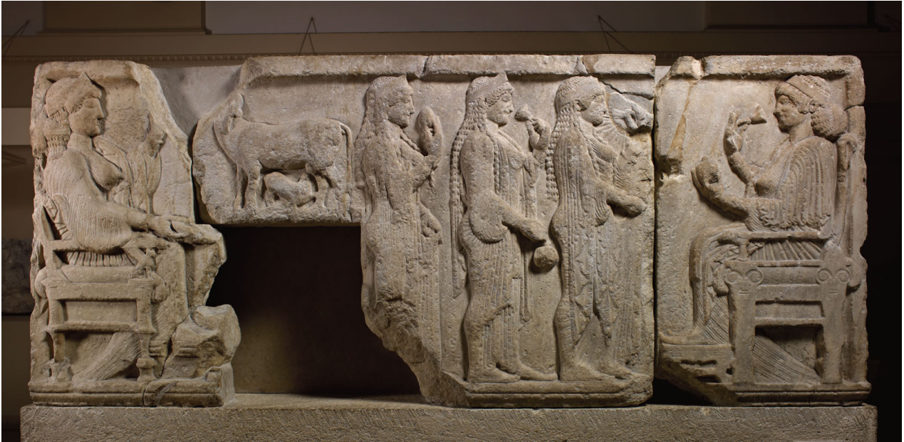
Figure 9. West panel of the Harpy Tomb with female figures, marble, ca 480–470. Xanthos, Lycia. London: British Museum inv. 1848,1020.1.

dynastic figures on the Harpy Tomb who are spatially separated. Finally, the sculptural programme of the Nereid Monument (as well as the Harpy Monument) was perpetually visible to broader audiences long after the dynasts were interred. Thus, the Nereid Monument, as well as other tombs from Lycia, must be studied for their role as public monuments, and, in particular, as public dynastic monuments that may have had varying effects on their viewing audiences; the remainder of this subsection will deal with this first point, and the next subsection will address the last two points.