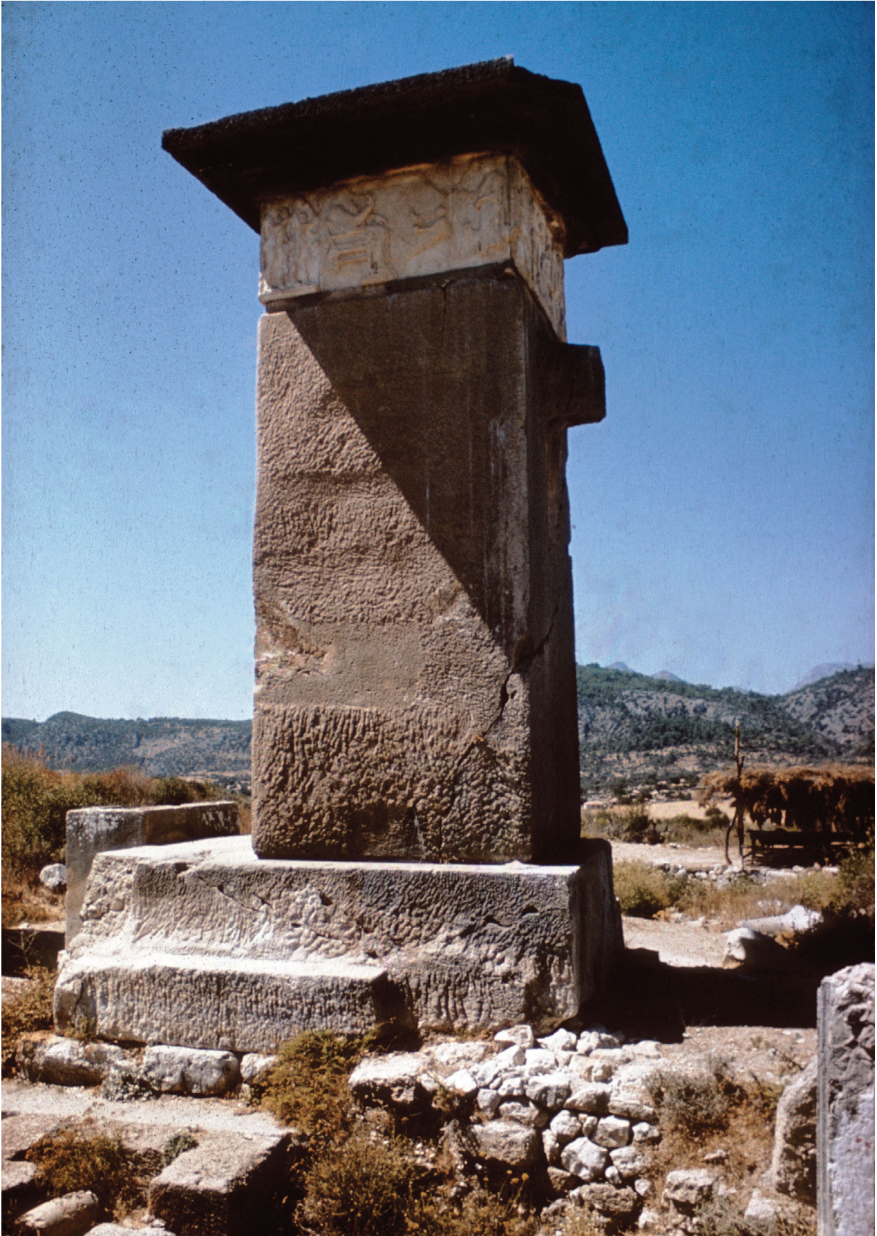
Figure 8. View of the Harpy Tomb in situ, ca 480–470 BCE. Xanthos, Lycia.