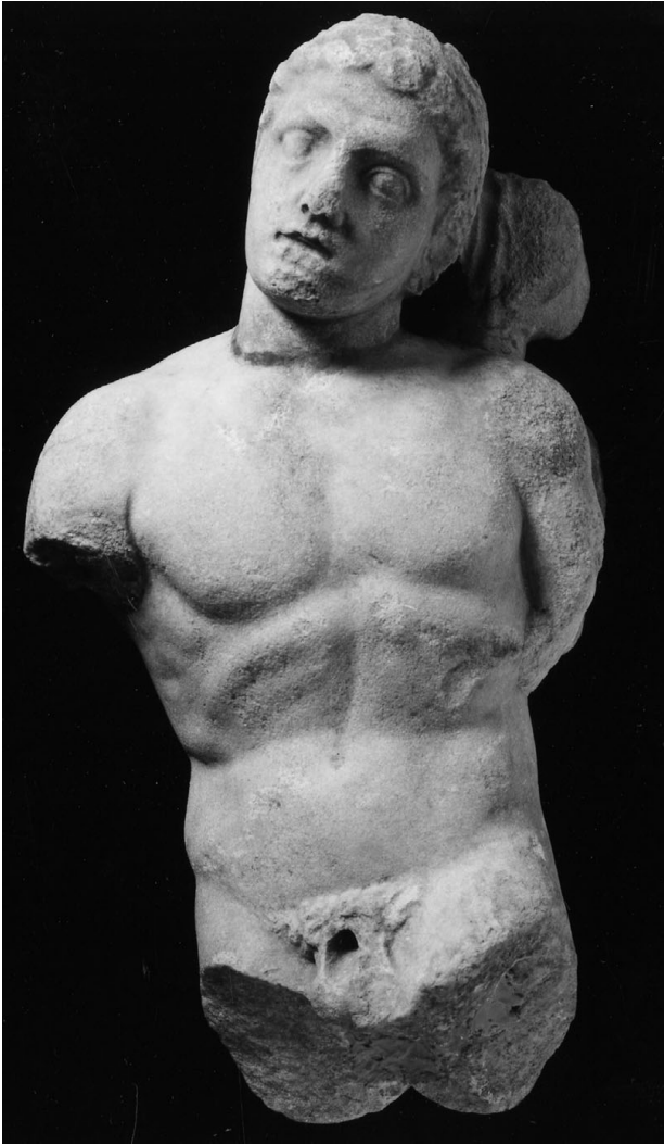
Figure 17. Acroterion from the Nereid Monument, marble, height: 86.36cm, ca 390–380 BCE. Xanthos, Lycia. London: British Museum inv.1848,1020.133 (927).