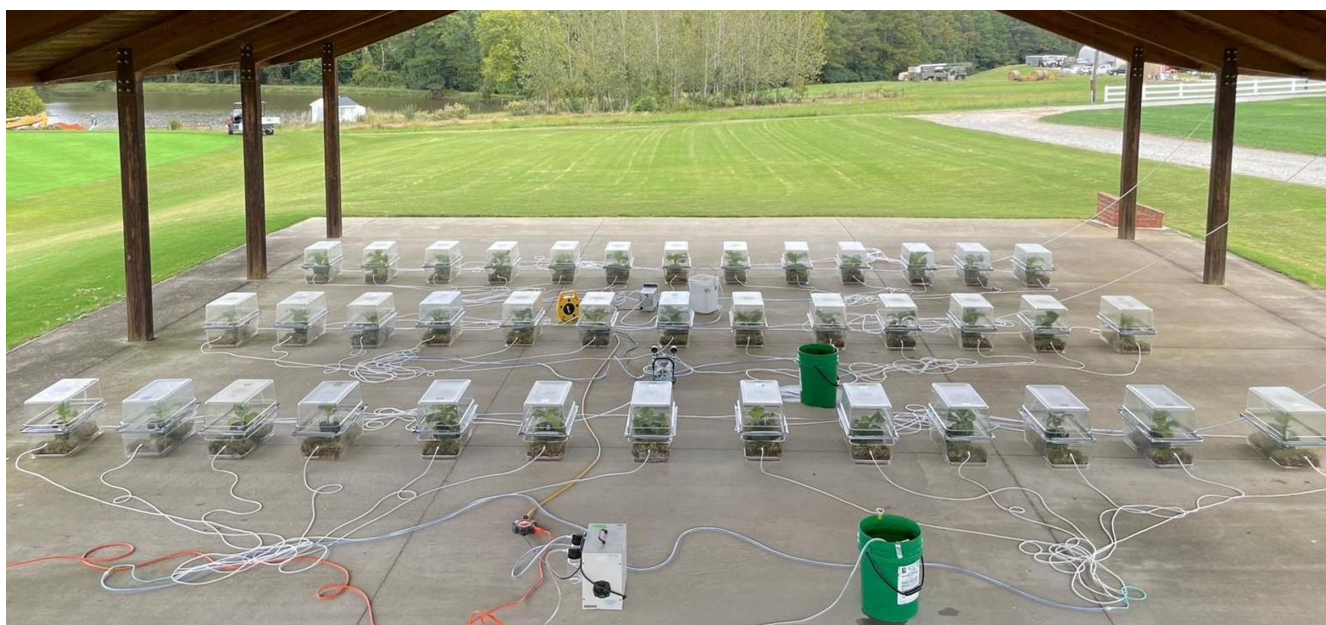
Figure 1. Humidome study in an open pavilion at the Lake Wheeler Turfgrass Field Laboratory in Raleigh, NC. Each humidome contained one tobacco plant between two trays that contained bermudagrass, which was either untreated or treated with a herbicide.

b Experimental runs 1 and 2 for soybean were conducted in October 2021; experimental runs 1 and 2 for cotton were conducted in October 2022; and experimental runs 1 and 2 for tobacco were conducted in October 2021 and experimental runs 3 and 4 were conducted in October 2022.