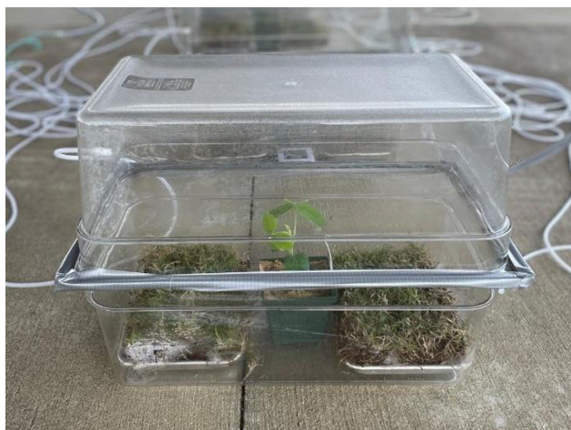
Figure 2. A soybean plant between herbicide-treated bermudagrass trays in a humidome.