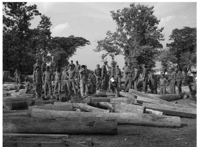
PLATE 1 Bodoland Forest Protection Force members with confiscated materials at Kachugaon base camp.

The Bodoland Forest Protection Force has been patrolling the forest since April 2006 (Plate 1), supported by the Bodoland Territorial Council, with two patrolling trucks and one large logging truck. Coordinated by RI, it is stationed at Kachugaon and Raimona within the Kachugaon and Ripu Reserve Forests, respectively. Volunteers patrol day