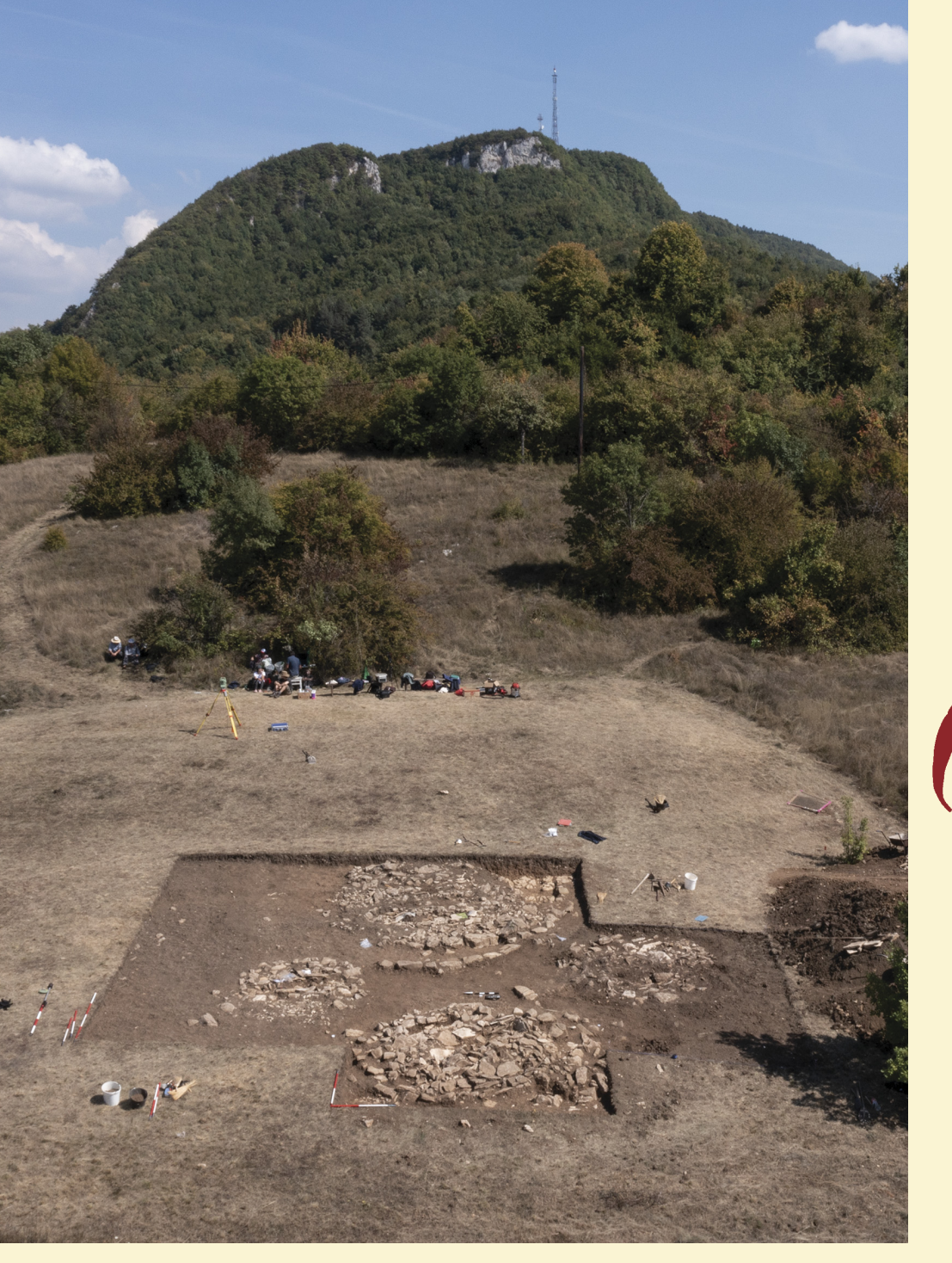
www.antiquity.ac.uk Volume 97 • Number 392 • April 2023