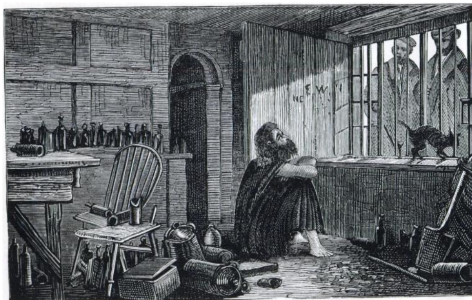
PORTRAIT OF THE HERMIT.