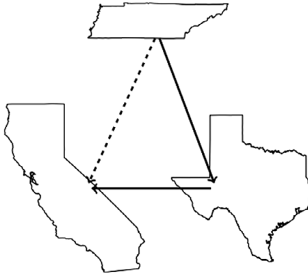
Figure 1. Transitivity Example.

illustrating how the citations can lead to transitivity. Since Texas's citation motivated Tennessee's decision to cite California, this reflects policy diffusion's learning mechanism; court A adopts a policy after learning about it from court B.