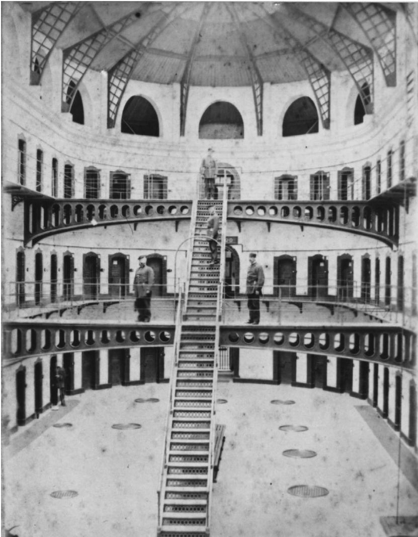
Figure 3.1 Interior of East Wing, Kilmainham Gaol, Dublin by Thomas Flewett, Deputy Governor, 1860s