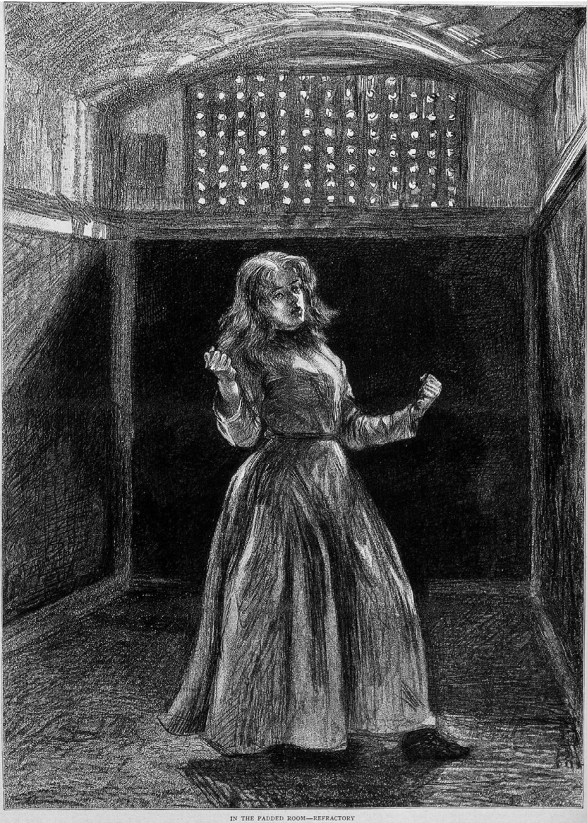
Figure 3.3 Woking Convict Invalid Prison: a woman prisoner in solitary confinement. Process print after P. Renouard, 1889