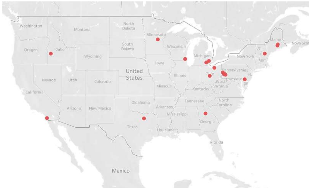
Figure 2. Geographical representation of EC educator participants (n=22; red dots)