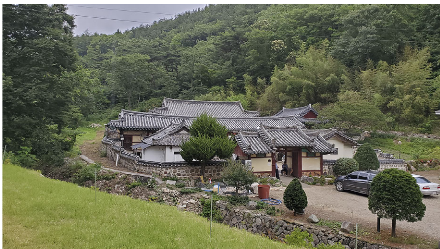
Figure 5. Puun-jae near Yu Sam-jae's Tomb. 14 June 2023.

kingdom. 87 In 1795, Yu Han-mo (1734–1816), during his appointment as magistrate of Kyōngju, recovered the lost residence of the Yu family of Silla and a well. 88 For the rest of the Chosŏn dynasty, the members of the Kigye Yu provided resources to repair and expand the Puun-am, which remained the lineage's guardian hermitage and purification hall ( chaesil ) (figure 5). 89 Multiple generations of Kigye Yu members made various contributions to securing and protecting their founding ancestor's identity, and they often fully capitalized on their positions as county or provincial officials. Members both local and from the capital closely collaborated to achieve their goals. 90