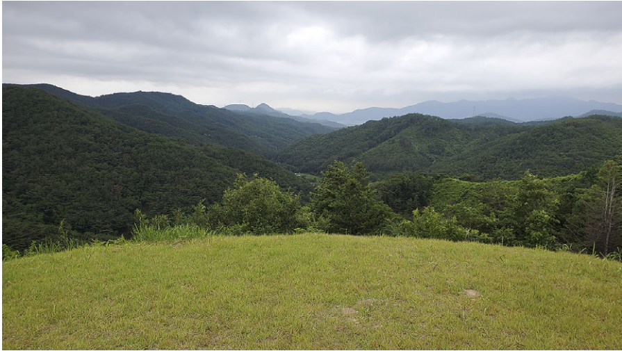
Figure 3. Topographical features as seen from Yu Sam-jae's tomb facing south. 14 June 2023.

rugged mountains much farther from the residential areas (figure 3). 75 Another bit of circumstantial support for the Tang-dong site was its unrivalled geomantic merit, which surely suited the purpose of recognizing a founding ancestor. 76 Thanks to Ha-gyōm's efforts, the Kigye Yu linked the Tang-dong tomb to their founding ancestor and immediately erected a stone marker there. The Chōng family had to relocate its ancestral burials, although the Sō Hon couple's tomb was left intact. 77 This is shown on the "Illustrated Map of Yu Sam-jae's Tomb" (Sijo Yu Sam-jae punsan chi to) inserted in the 1704 genealogy (figure 4). 78