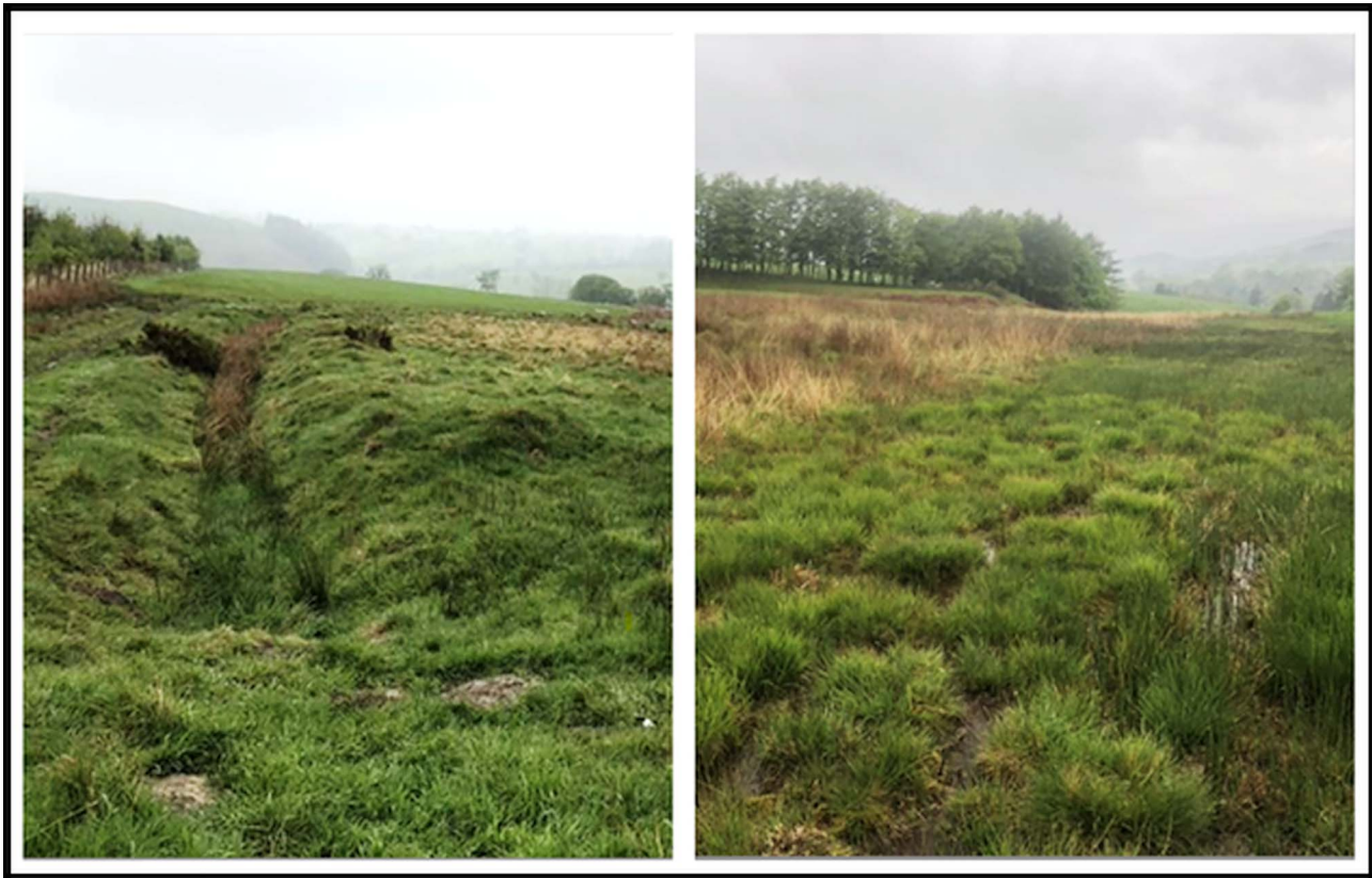
Fig. 1. Example of a watercourse habitat (left) and pasture habitat (right), both from Farm B in this study.