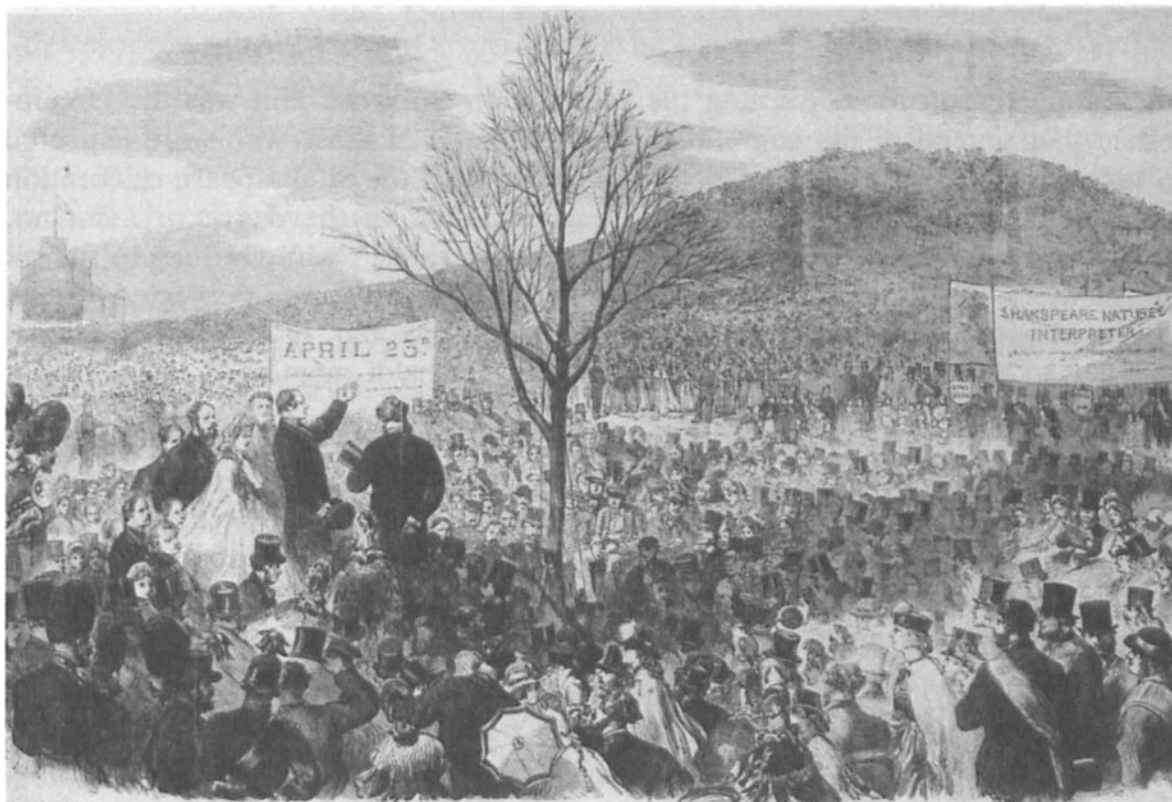
Figure 3. The planting of an oak tree during the ceremony on Primrose Hill in 1864 to commemorate the tercentenary of Shakespeare's birth ( The Illustrated London News , 30 April 1864, p. 413)

imperial rule. 46 Above all Shakespeare was a defiantly plebeian figure. Lloyd's Weekly Newspaper wrote: