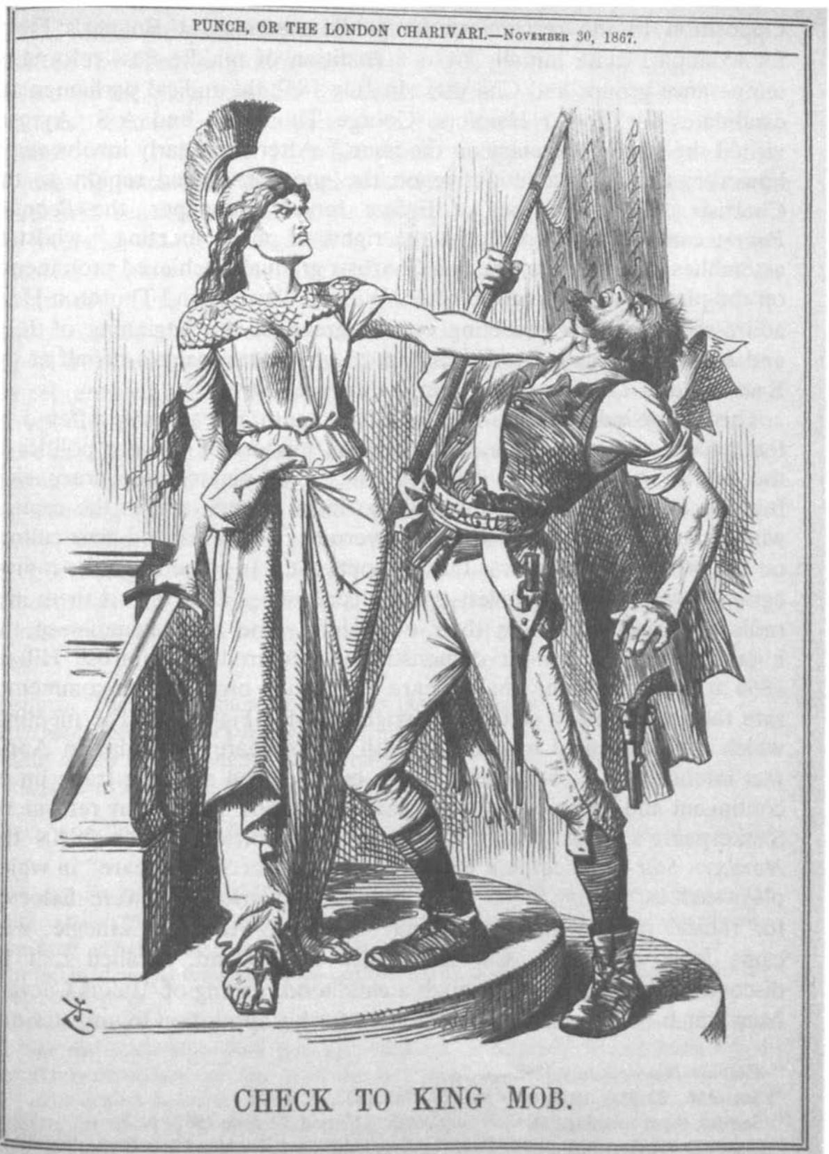
Figure 2. Punch celebrating the demise of the crowd violence associated with the Reform League after the passage of the 1867 Reform Act ( Punch , vol. 53, 30 November 1867, p. 221)