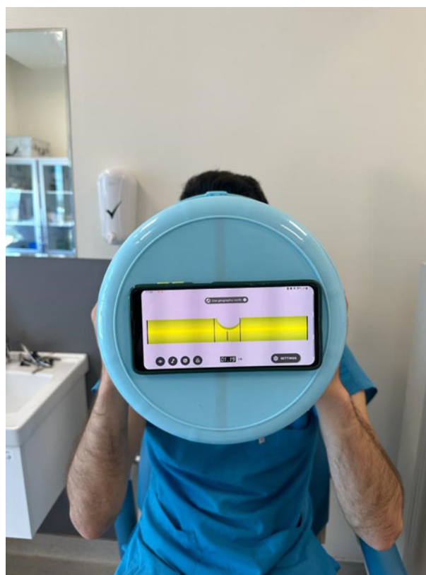
Figure 1. The smartphone-assisted modified bucket test.

Vertigo dizziness imbalance scores and subjective visual vertical deviations were compared between patients with and without BPPV using an independent sample t -test. Paired t -tests were utilised for other assessments. Statistical analyses were