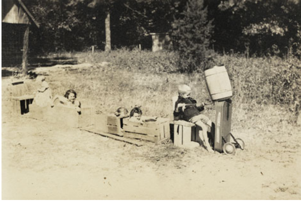
Figure 1. A group of Highlander Nursery School children making a train with wooden crates.