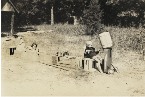
Figure 1. A group of Highlander Nursery School children making a train with wooden crates.