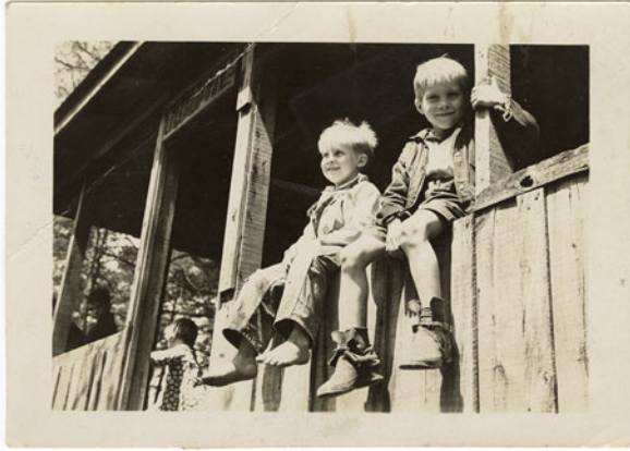
Figure 3. Two children on the porch of the nursery school, 1930s.