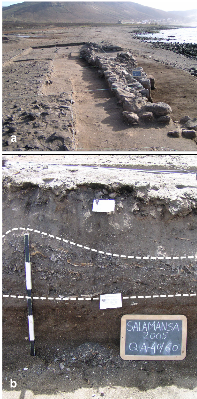
Figure 3 Archaeological excavation at the settlement site of Salamansa: a) overview of the archaeological site; b) stratigraphic profile of the section from which the samples Salamansa QA Am1 and QA Am2 were collected. Organic remains (goat bones, marine shells, turtle carapaces and plastrons, charcoal) between the 2 dashed lines.