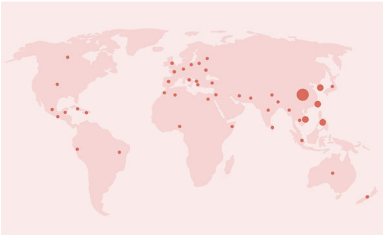
Figure 3. Distribution of sending places in included citations.