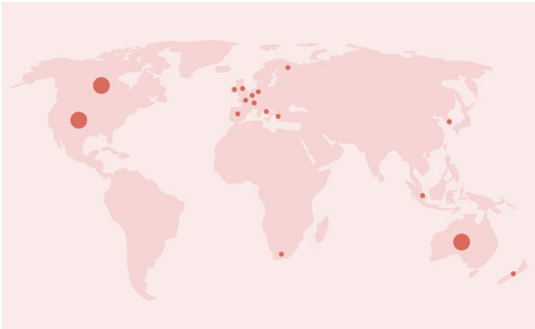
Figure 2. Distribution of receiving places in included citations.

policies ( n = 13 ). Only five empirical studies used quantitative methods (questionnaires), while three used mixed methods (both questionnaires and interviews).