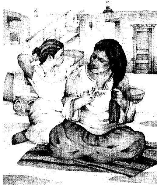
19 x 24 Señoritas de la Villa $85.00