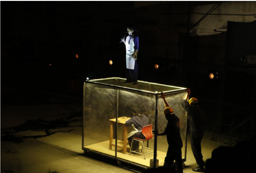
FIG. 3 A large object for a small action.