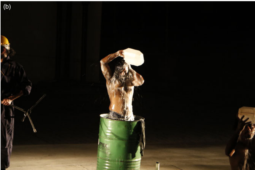
FIG. 2B Sanitation workers clean up after work. Photograph by Ramkumar Kannadasan. Reproduced here with permission of the photographer.

the drums and disappeared from sight, jerry cans of water were handed to them while another group of actors poured an oily black liquid on their heads. Once they were lidded over, a sound piece that cited deep drains, sewers, defecation, the