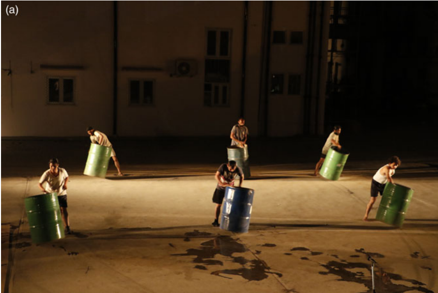
FIG. 2A Oil drums as exteriorized manholes. Photograph by Ramkumar Kannadasan. Reproduced here with permission of the photographer.