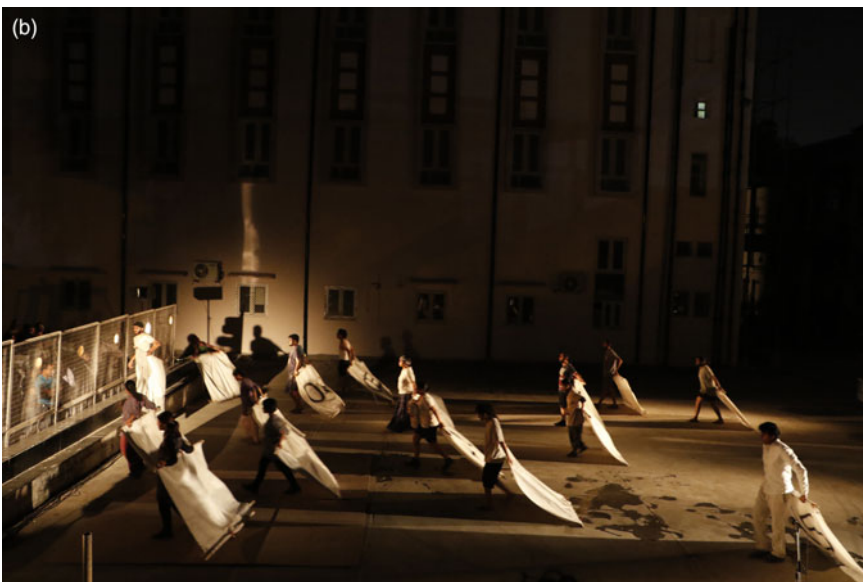
FIG. 1B Settlements on the move.