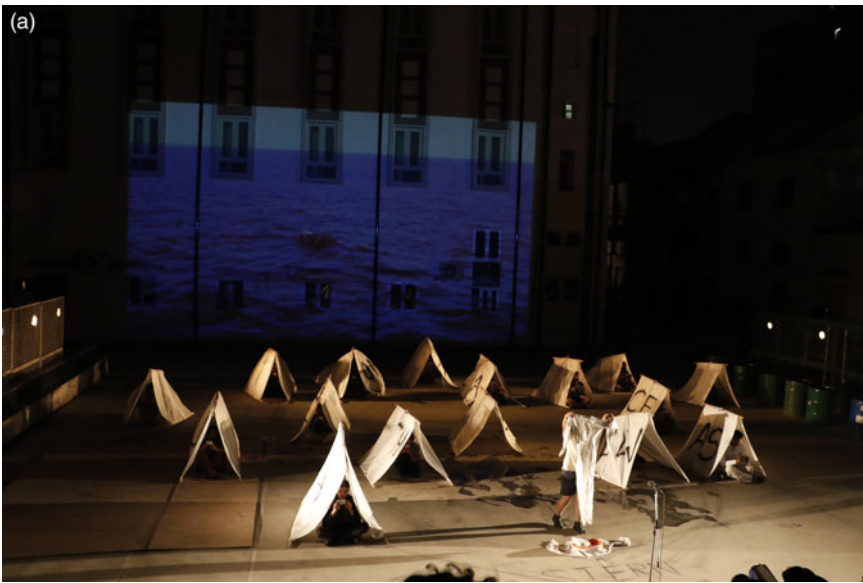
FIG. 1A Makeshift shelters.