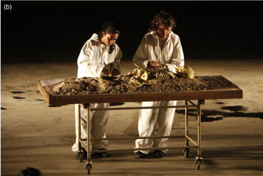
FIG. 5B A gurney bearing a skeleton.

A line drawn with water on the concrete floor delineates the stern of a ship, in which refugees and trafficked humans are setting off on a precarious journey by boat. The water drawing will evaporate even as fixers haggle over which body part is worth what destination for a refugee (Fig. 5A).