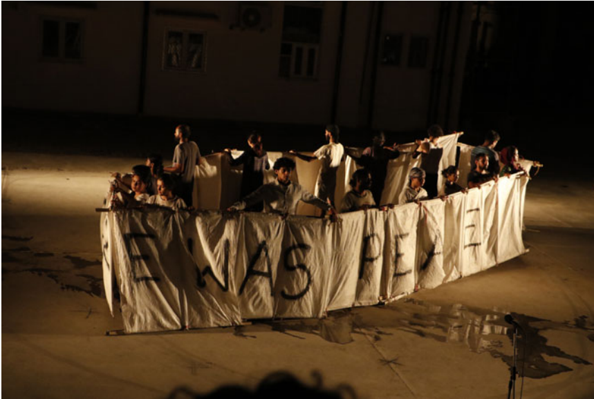
FIG. 1C A dinghy floating on water.

Tents: makeshift shelters that house millions today: those displaced by wars and violence, climate disasters, hunger and unemployment, and urban rebuilds.