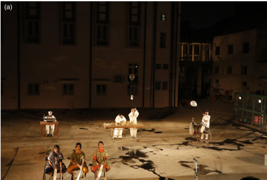
FIG. 5A Alignment. Photograph by Ramkumar Kannadasan. Reproduced here with permission of the photographer.