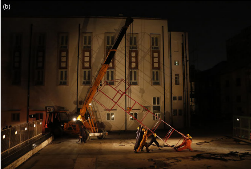
FIG. 4A, B Continued.

Hammering houses, hammering factories, hammering up cities. Finding an action to handle the hammer began as it did for the tent, by crafting the object itself. The hammer has a long social history and to embody that Deepan Sivaraman decided to make it a massive, twenty-five-foot-long iron object (Fig. 4A, B). The performers worked with a welder as collective action and painted it red. The size of the hammer defined the nature of the action: ten performers needed to coordinate precisely with each other to lift it and move it, to balance it and angle it, to connect it to the arm of the crane for it to be lifted off the ground and repositioned. The performers unhooked the hammer, the crane reversed out of the performance area, and the hammer was hefted on the shoulders of the performers and carried away to the back of the buildings.