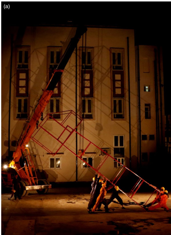
FIG. 4A, B Hammer and crane.