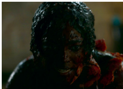
Figure 13 Ruby transforming back into her Black body while attacking her manager