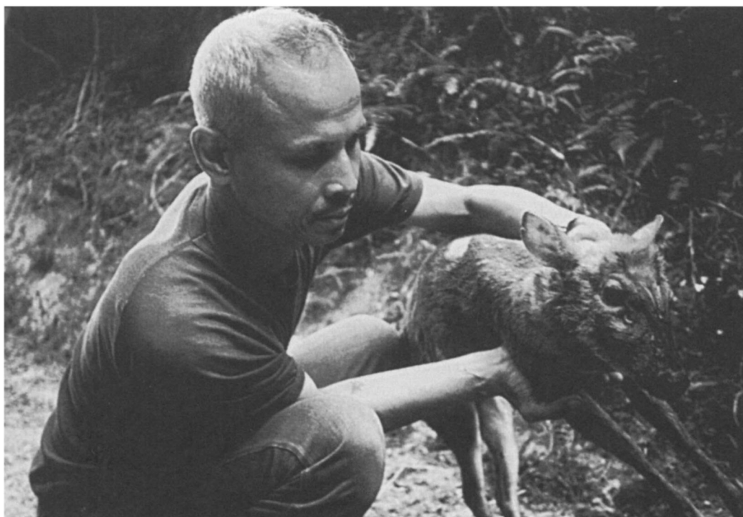
Right. A local hunter emerging from the forest with a freshly snared deer that was later identified as a new species, the leaf muntjac ( Alan Rabinowitz ). Above. Expedition team member with the adult female leaf muntjac killed by the hunter ( Alan Rabinowitz ).

medium-sized red barking deer, which was often seen in lowlands and edge habitat. There were also reports of a 'black barking deer' from the far north, beyond the Nam Tamai River. Eventual examination of specimens revealed that two of the deer are new species for Myanmar. The intermediate-sized red deer, which was locally abundant, was the Indian muntjac Muntiacus muntjak . Information on the two new species for Myanmar is given below.