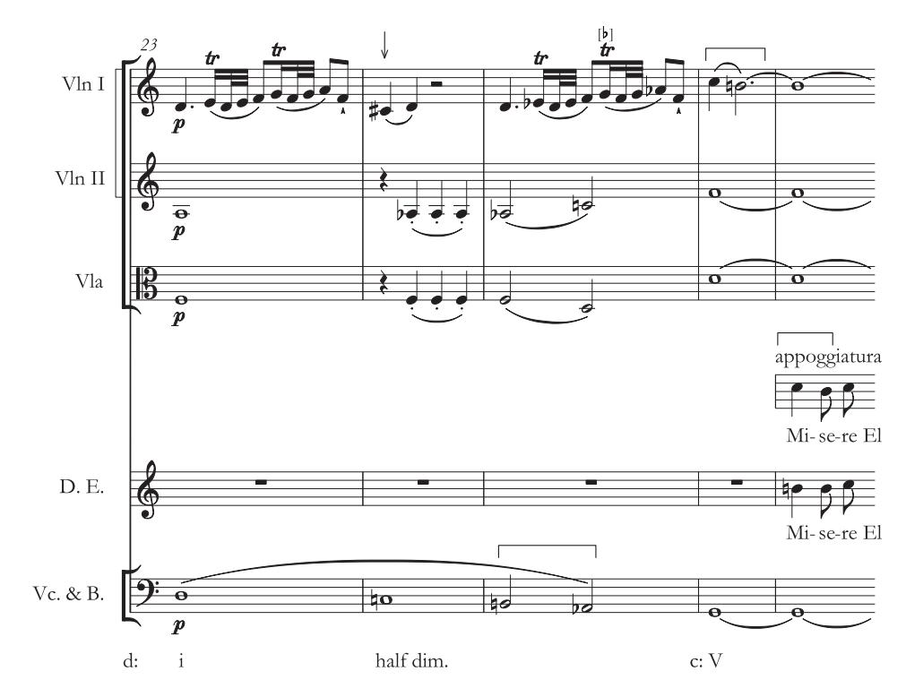
Example 2 Mozart, 'In quali eccessi', bars 23-27.