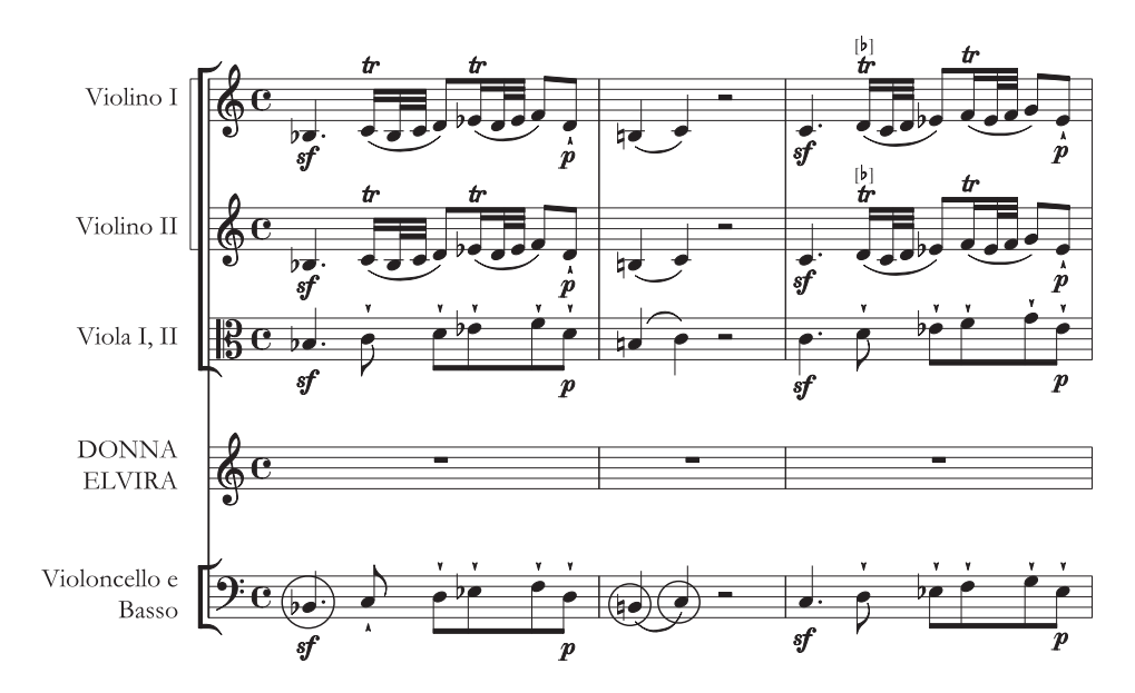
Example 1a Mozart, 'In quali eccessi', bars 1-5.