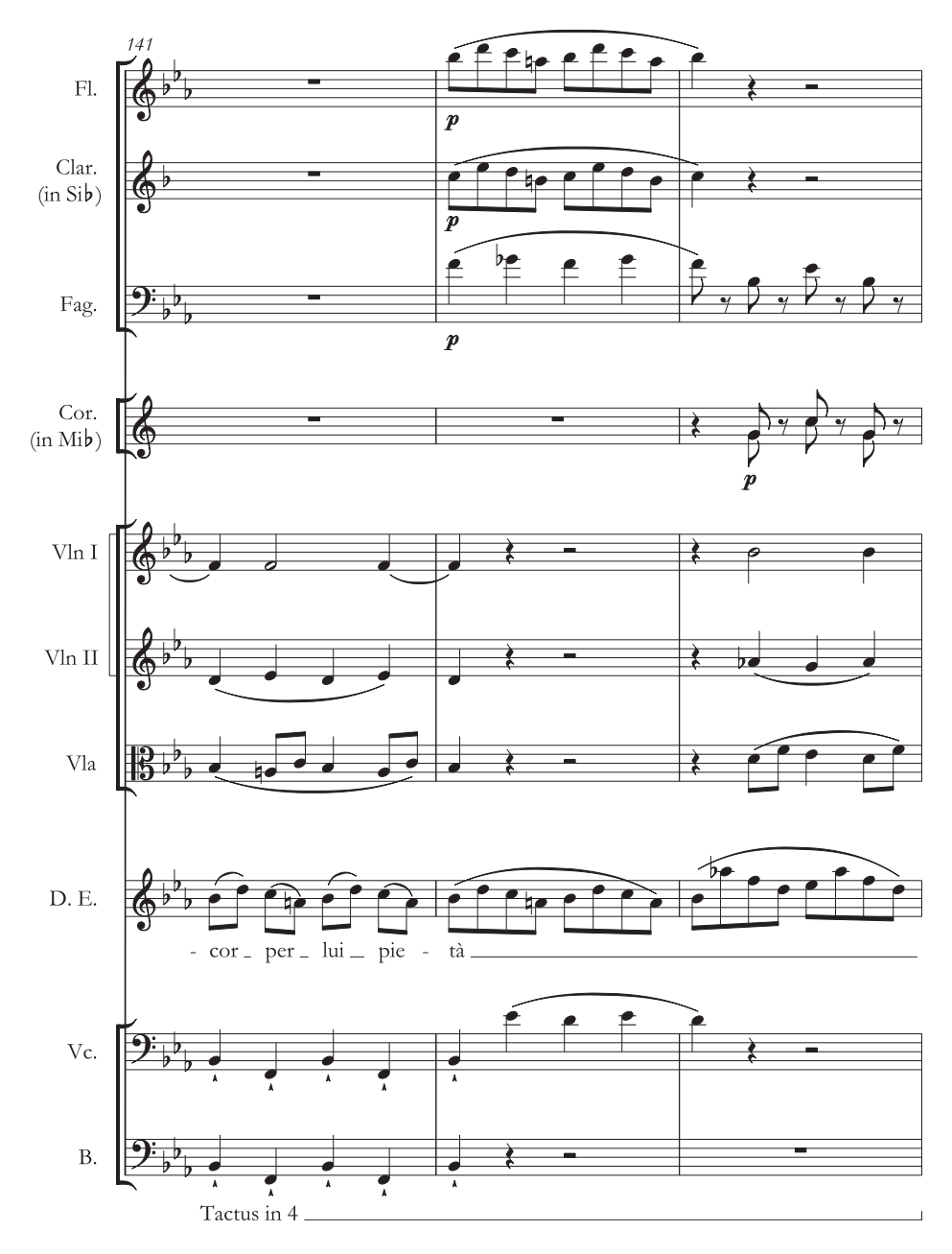
Example 4. (Continued)

out to its maximum length. Most significantly, the melisma focuses and extends the word 'pietà', thus marking the culmination of a psychological process referred to repeatedly in the libretto in Act II but given musical voice only here, in the final moments of the aria (and not, notably, in the first episode where Mozart set the same two lines of text).