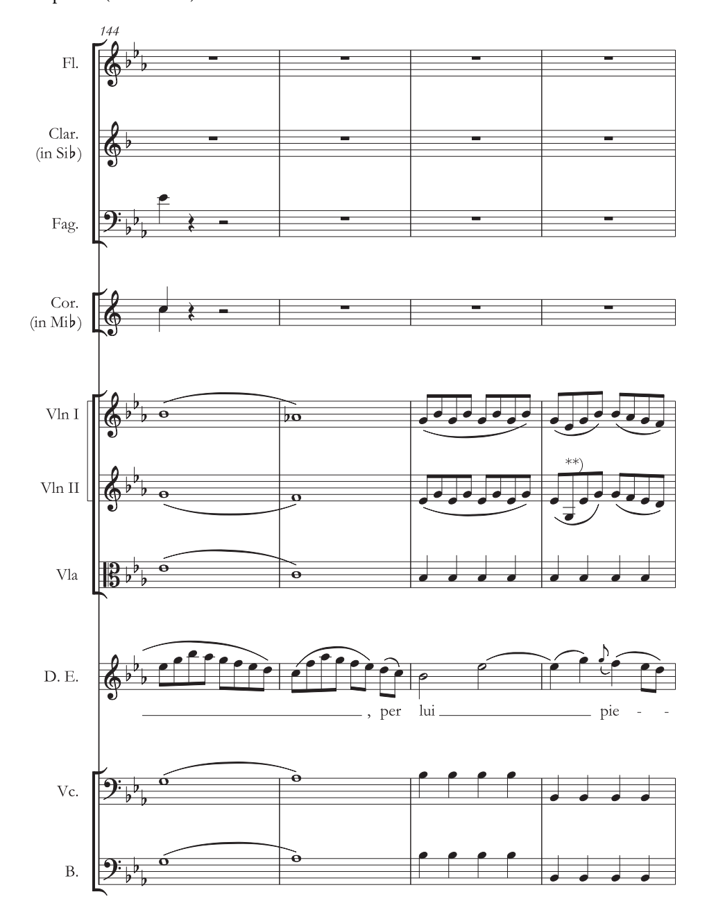
Example 4. (Continued)

This drive to closure, and its interaction with the word 'pietà', subverts one of Elvira's defining traits from Act I. Although her two previous arias are laced with cadential patterns, Elvira seems unwilling to allow musical closure to take its course. Her previous arias end clumsily, and in both cases with a measure of comic bombast.