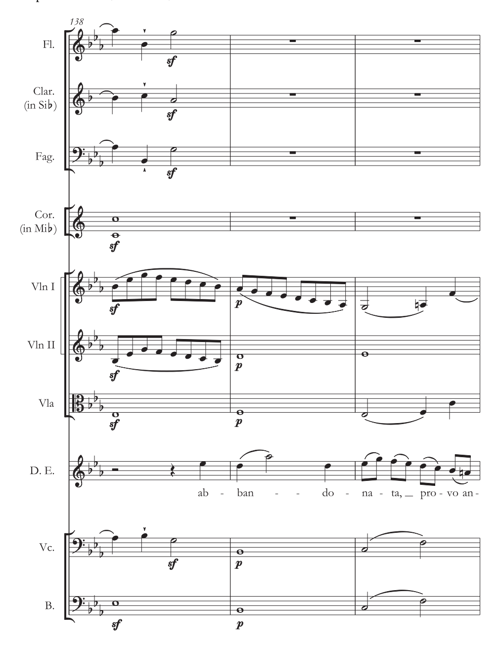
Example 4. Mozart, 'Mi tradì', bars 138-50.

opening idea (the source of the melisma's motif) was previously shared among solo voice and orchestral winds. These phrases also suggest a broader shift in outlook. Whereas the episodes, and perhaps the rondo theme itself, seemed to begin tentatively, in search of momentum, the coda now combines a confident, sweeping forward motion with an emphatic sense of rhetorical closure, each phrase drawn