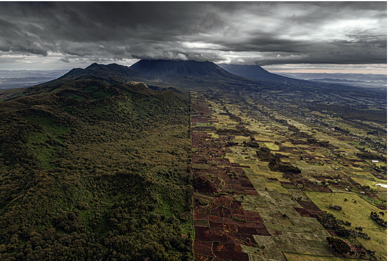
Photo: Habitat destruction leads to disease emergence, but the underlying mechanisms, the prediction and the prevention of possible outbreaks are still poorly understood. Knowing and cataloging pathogens that affect ape species may benefit human medicine while supporting conservation efforts. Habitat conversion along the edge of Volcanoes National Park.

Moreover, the governance of tourist sites that offer visits to wild, habituated ape populations would benefit from the joint input of professionals, including conservationists, ecologists, ape managers, travel medicine specialists and social scientists (Muehlenbein and Ancrenaz, 2009; Munanura, Backman and Sabuhoro, 2013; Russon and Wallis, 2014a). The first step could be to conduct an in-depth assessment of ape visitation sites, including through a cost-benefit analysis of current ape tourism projects and analysis of their contributions to ape conservation. The assessment could give rise to recommendations for improving governance and decision-making processes that guide ape habituation and ape-related tourism.