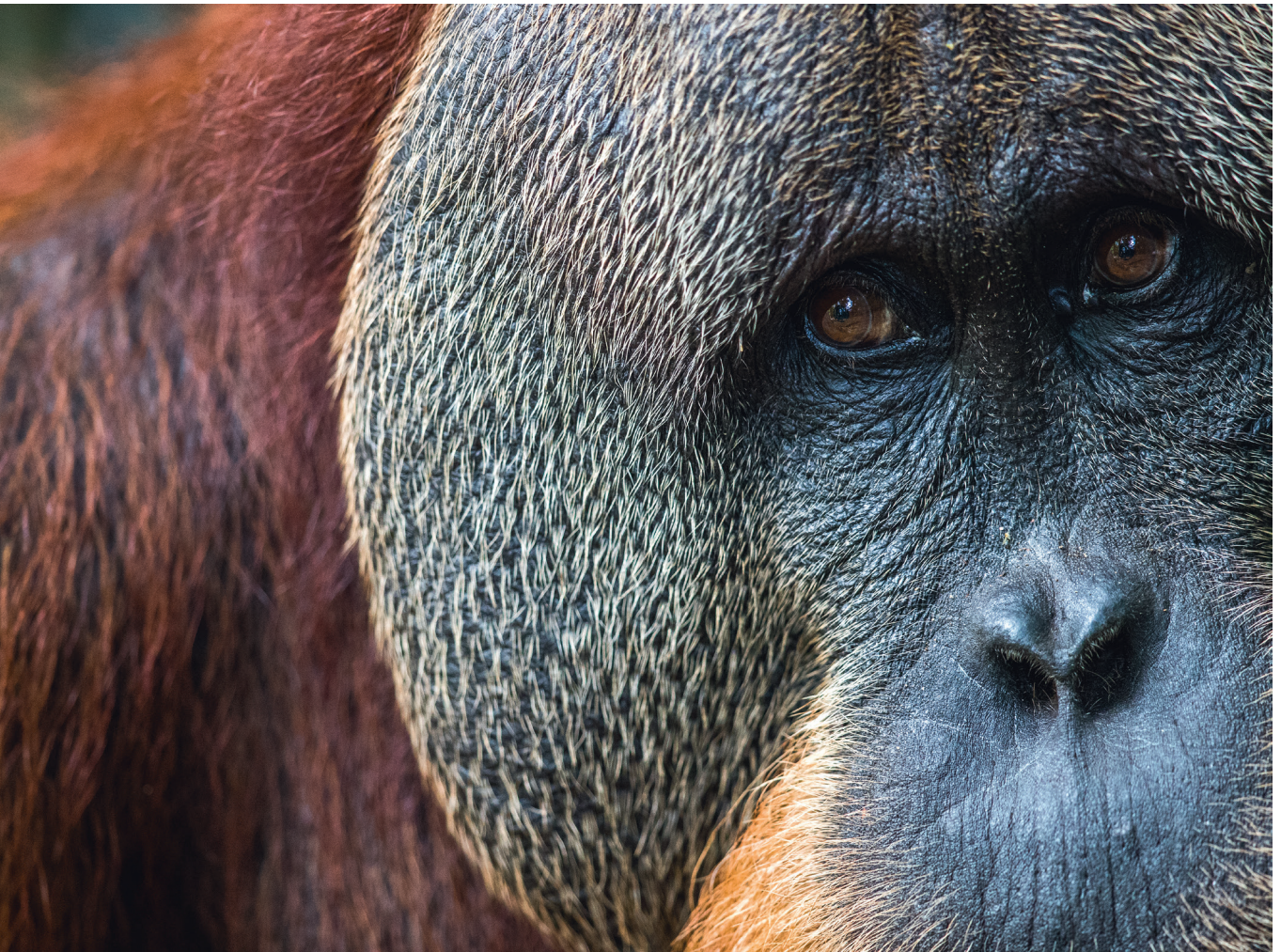
Photo: Apes—humans' closest living relatives—are intelligent, sentient beings with complex social lives. As such, they attract local and international scientists, students, tourists, filmmakers and other visitors in the wild and in captivity.

captive (and semi-captive) apes. The aim of a habituation process is to decrease the flight distance of apes when they encounter humans. The removal of apes' fear and need to flee effectively reduces any significant anthropogenic effect on their natural behavior, although some degree of human influence on their behavior is inevitable (Tutin and Fernandez, 1991; Williamson and Feistner, 2011). Moreover, habituation directly heightens the risks of disease spillover to apes, as they tolerate closer proximity to people (Köster et al. , 2022; Russon and Wallis, 2014a). One way of minimizing these risks is to ensure that habituation and