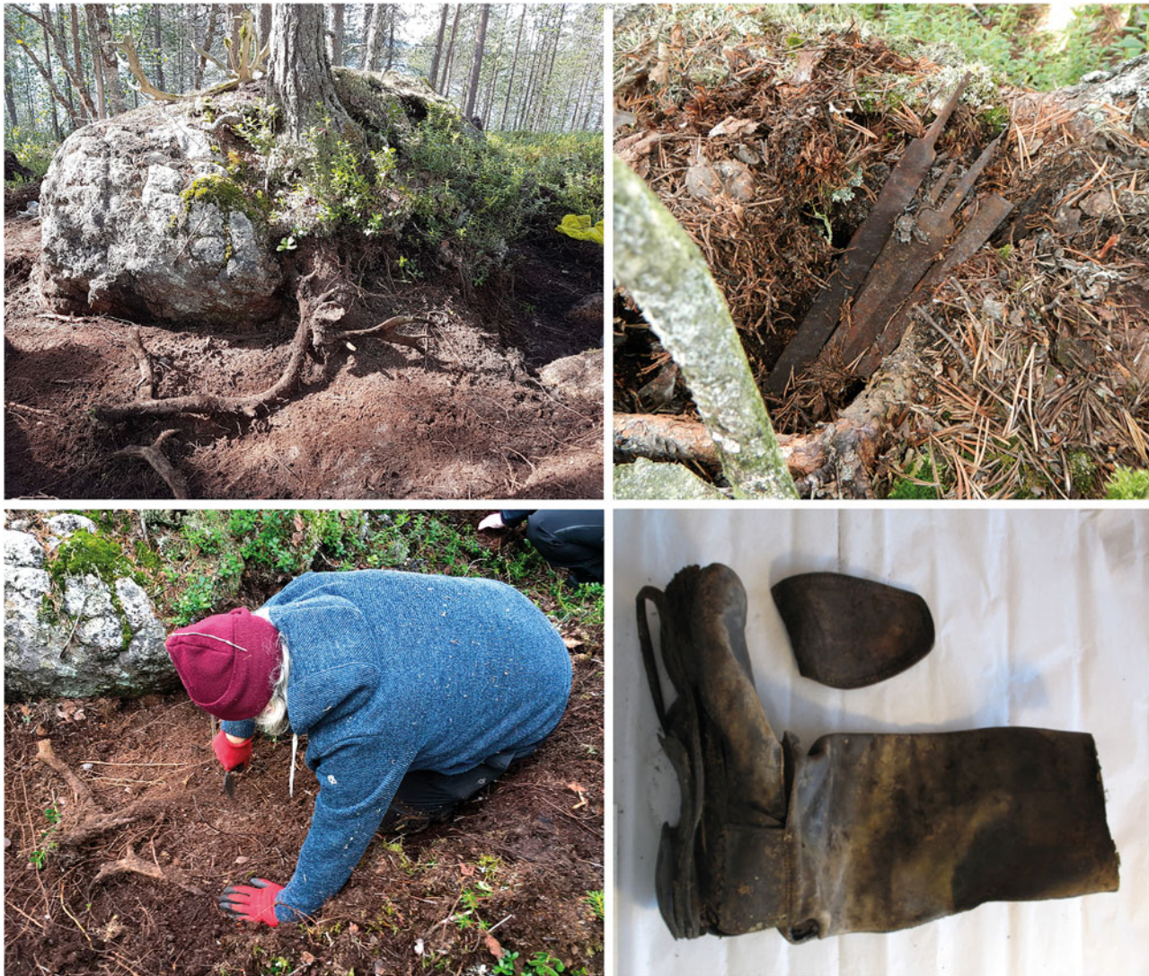
Figure 3. Selected features documented around the boulder at Hyljelahti. Top left: Reindeer antlers on top of the boulder and three more antlers entangled with the tree roots being excavated at the base of the boulder. Top right: Four files found in a bundle under the turf below the antlers on the top of the boulder. Bottom left: Iain Banks uncovering the three antlers and the German military jackboot that covered the antlers at the base of the boulder. Bottom right: The German jackboot excavated by the boulder, after conservation.

as paint cans, look like casual dumping of rubbish. Whether or not there is a direct link here, the non-casual depositing echoes traditional Sámi sacrificial practices at sieidi sites. There is a long history of ‘spiritual engagement’ with the environment and various landscape elements in northern Fennoscandia, sometimes involving depositional practices, from prehistory to modern times, and not only among the Sámi (e.g. Äikäs 2015; Herva & Lahelma 2019). Several features of the Hyljelahti boulder have connections with finds and features from some other sites in Lapland that relate to the folkloric traces of the German military presence in WWII. Overall, we