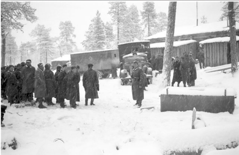
Figure 1. Top: Multinational Sápmi and the discussed sites in northern Finland. (1) Inari Hyljelahti; (2) Inari Haukkapesäoja; (3) Inari Kankiniemi; (4) Inari Martinkotajärvi; (5) Sodankylä Kopsusjärvi; (6) Savukoski Seitajärvi. (Background map: Esri.) Bottom: Soviet Prisoners of War (on the left) outside their log house with German guards (on the right) at Inari Haukkapesäoja, Lapland.

are still very much in the margins of both the research and the grand narratives of modern war. 1 Nonetheless, there are indications that superstitions, with their material/talismanic expressions, abounded also during WWII, as illustrated by MacKenzie's (2015; 2017; see also Gregory 2019) research on superstition as a means of coping with the constant threat of death. Recent work in Finland has indicated that premonitions and other strange ('supernatural') experiences were common among Finns both on