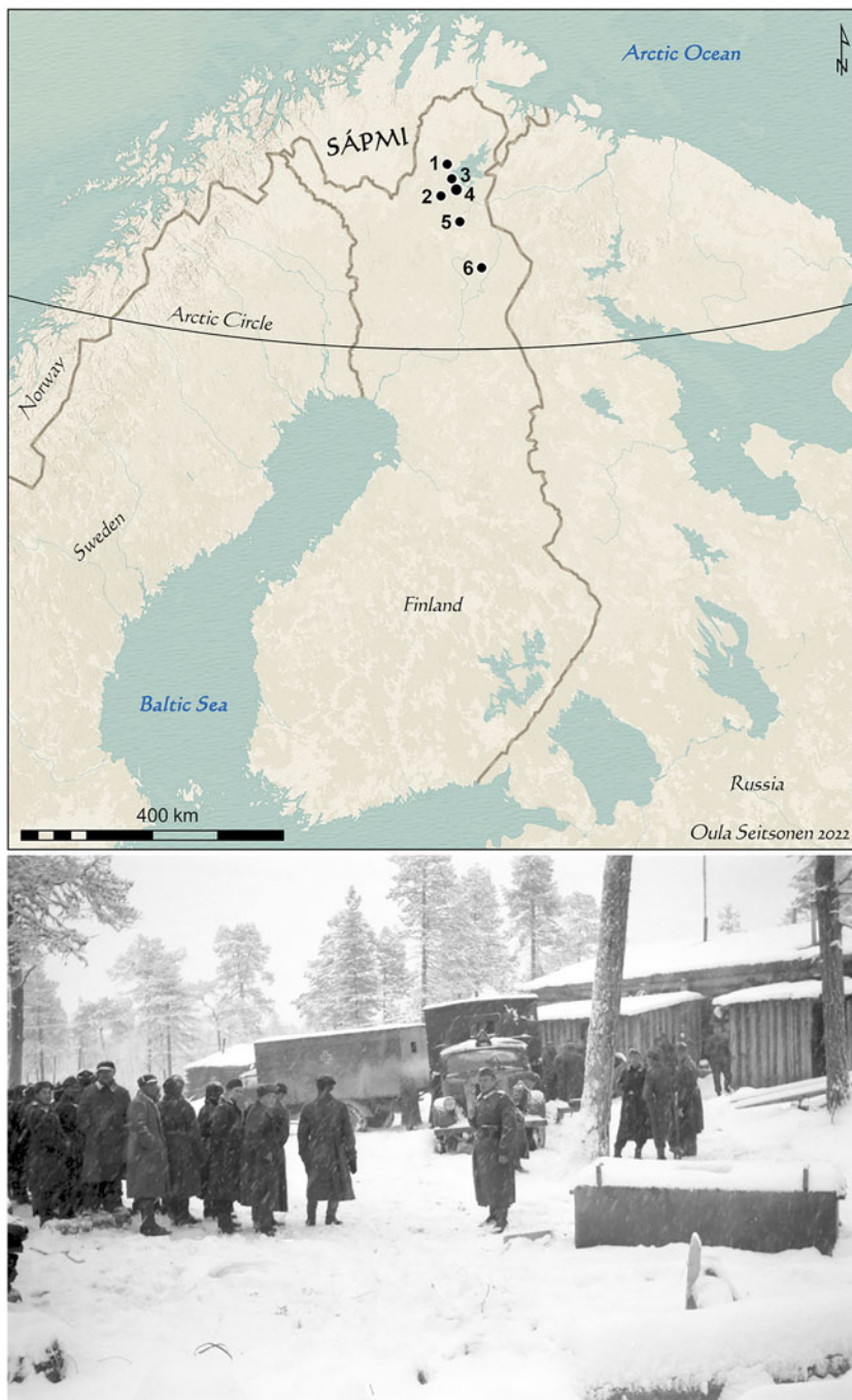
Figure 1. Top: Multinational Sápmi and the discussed sites in northern Finland. (1) Inari Hyljelahti; (2) Inari Haukkapesäoja; (3) Inari Kankiniemi; (4) Inari Martinkotajärvi; (5) Sodankylä Kopsusjärvi; (6) Savukoski Seitajärvi. (Background map: Esri.) Bottom: Soviet Prisoners of War (on the left) outside their log house with German guards (on the right) at Inari Haukkapesäoja, Lapland.

are still very much in the margins of both the research and the grand narratives of modern war. 1 Nonetheless, there are indications that superstitions, with their material/talismanic expressions, abounded also during WWII, as illustrated by MacKenzie's (2015; 2017; see also Gregory 2019) research on superstition as a means of coping with the constant threat of death. Recent work in Finland has indicated that premonitions and other strange ('supernatural') experiences were common among Finns both on