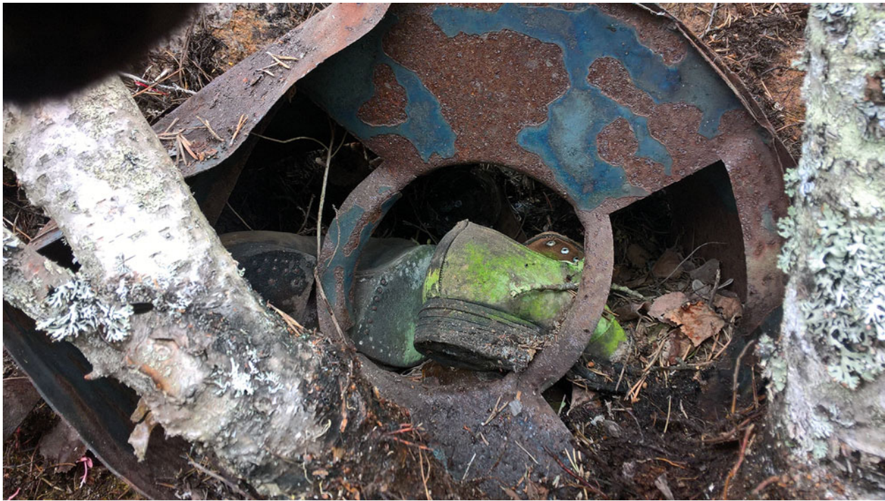
Figure 8. Women's shoes placed inside a wartime stove.

of PoWs and their harsh treatment, which disturbed local people, and perhaps explains why PoW camp sites have a particular 'haunting potential', with memories and places becoming entangled so as to make them experientially disturbing.