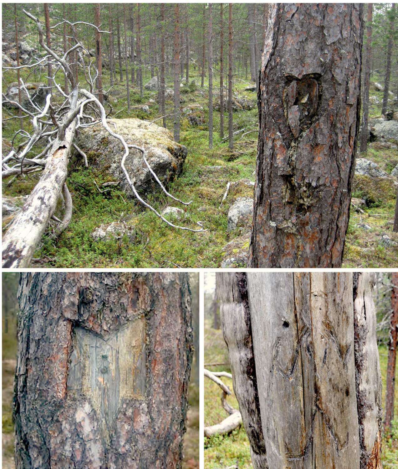
Figure 7. Top: Heart carved into a pine at the Kankiniemi PoW camp. Bottom left: 'Partisan star', a pentagram carved on a pine along a German-built wartime Kopsusjärvi track in Sodankylä, with a bullet hammered into its centre.