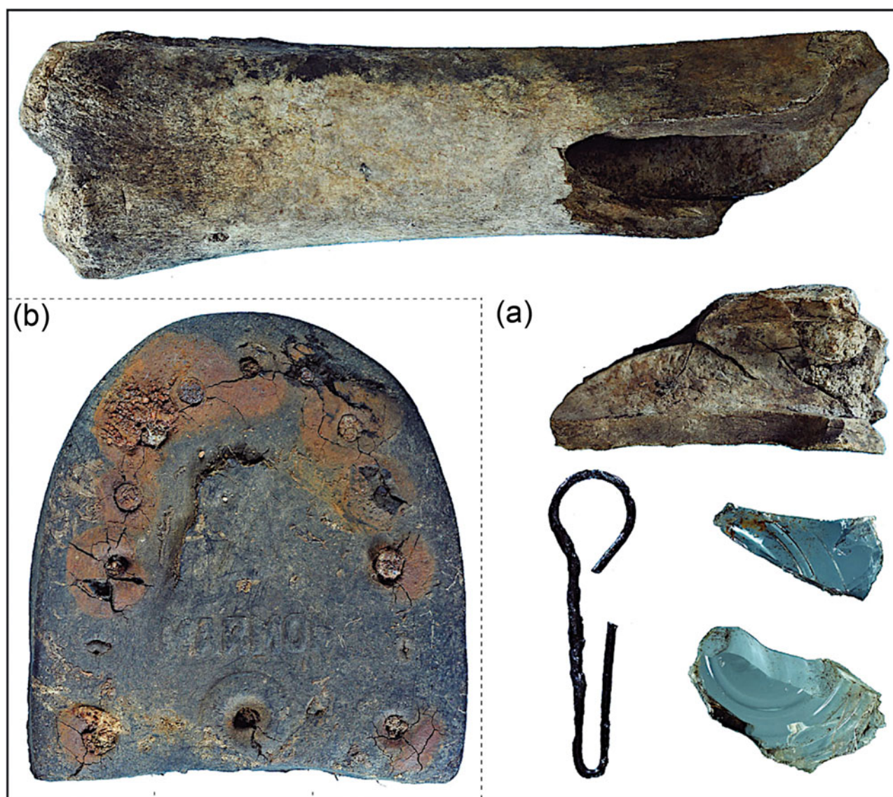
Figure 5. Finds uncovered at the base of the Taavetti Lukkarinen hanging-tree. (a) The bone and the finds concealed inside it; (b) The shoe sole that capped the bone deposit. (Illustration: Emilia Jääskeläinen. Ikäheimo & Äikäs 2018, 102.)

have been an important and valued sacrificial item throughout much of the history of the Sámi sieidi , attested by sources since the sixteenth century (Olaus Magnus [1555] 1998). While the boulder at Hyljelahti is not a sieidi , this comparison helps to put the site in a broader historical context of northern human–environment relations, instead of regarding it merely as an isolated curiosity.