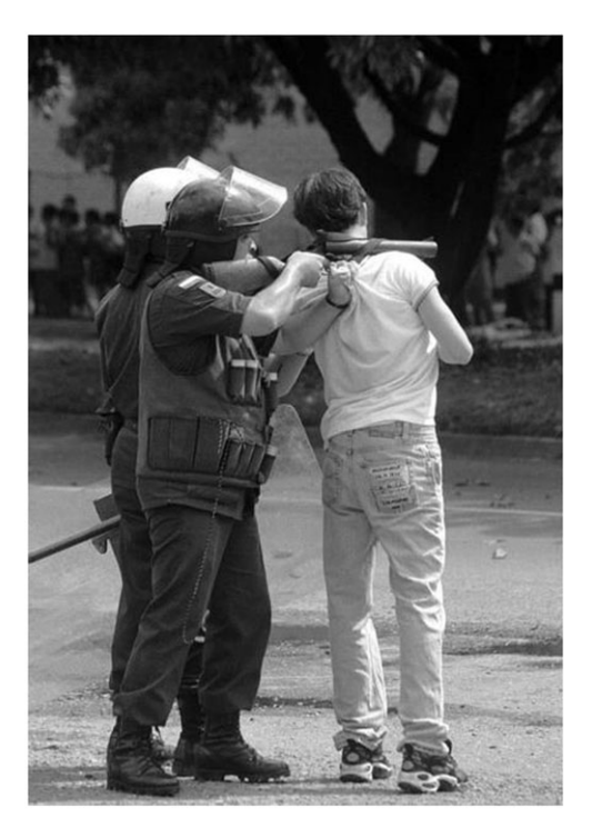
Figure 4. Jesús Abad Colorado, 1999. Colegio INEM, Medellín, Antioquia.

to kneel, and the child's hands appear tied, his eyes banded, and his face appears soulless – eyebrows raised in horror and mouth wide open, like a dead corpse. We also know Jesus Abad Colorado's famous image showing Colombia's EL ESMAD forces forcibly rendering a Colombian student motionless, and using him as a shield to deter the violence of other students (see Figure 4). Both are human shields in the traditional sense. Yet, the mainstream story is so powerful in the way it contextualizes the image. It can marginalize the historical practice of illegitimate-stranger state armed actors and, instead, mobilize images originating from this dynamic, like the First World War-era images, this time, to describe some purportedly 'contemporary' practice that materialized due to non-state actors' attempt to compensate for their weakness in some 'asymmetric' situation. How does this happen?