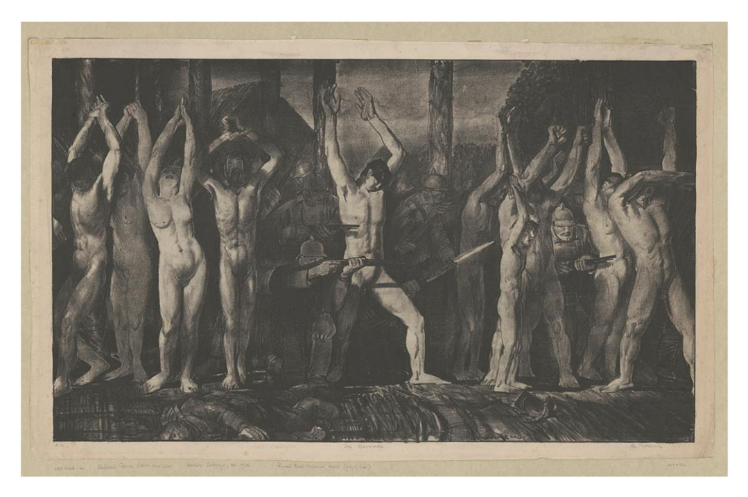
Figure 2. The Barricade, George Bellow, 1918. Library of Congress.

Figure 2 is a book cover of the first ever historical account of human shields. <sup>96</sup> It features George Bellows' artwork inspired by Germany's conduct during the First World War occupation of Belgium. <sup>97</sup> Again, we see guns but almost do not see the soldiers, who are relegated to a dark, shadowy background. Contrasted with the soldiers' protective uniform and foregrounded weapons, in the foreground we see a manifestation of vulnerability: naked human flesh, hands raised to the sky, and eyes reflecting despair, horror, or bewilderment. Not unlike Solomko's choice of a woman and a toddler to depict vulnerability, the 'exaggeratedly large arms and hands of the victims, which are raised to the sky' as if in a gesture towards prayer 'call attention to their subjugation and acquiescence'. <sup>98</sup>