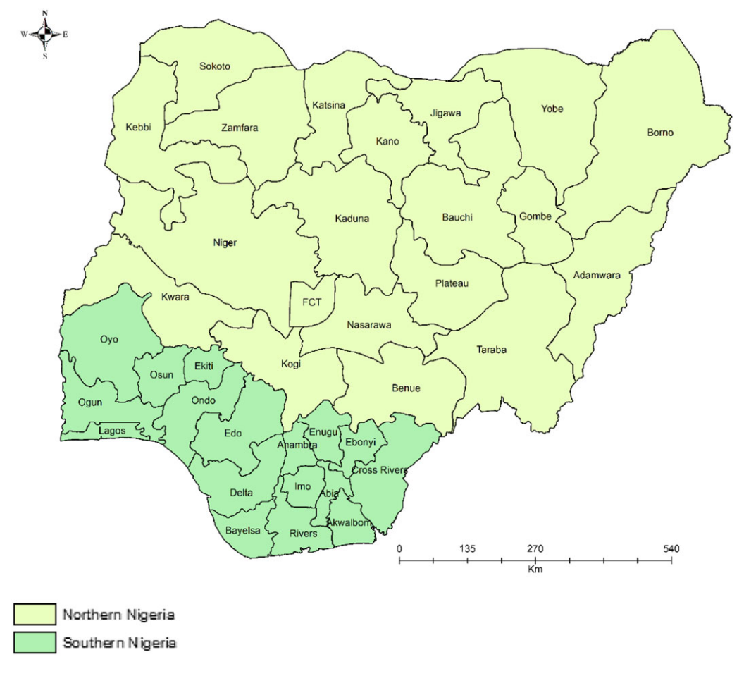
Figure 1. The 36 states and the FCT, and the region.