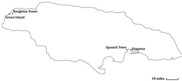
Figure 2 Map of Jamaica, 1804, showing location of Haughton Tower Estate. Map by Kacper Lyskiewicz.

owned 257 people who lived, enslaved, on Haughton Tower estate in the Western Jamaican parish of Hanover (Figure 2). 10