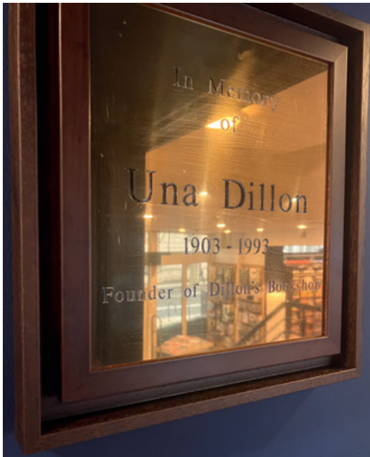
Figure 8 Picture of the reinstated Dillon plaque, taken on 1 May 2024

Booksellers of the past contributed significantly to the cultural and intellectual lives of the people they served: they should not be hidden in the bookshelves of history. They are often, as this Element has hopefully shown, dynamic agents within the communications circuit. The women booksellers, moreover, as this Element proves, should more correctly be known as formidable , using the French term and meaning, rather than formidable in the English sense. True, they did use clothing and accessories to create and support their business personas – but there is not a ravelled cardigan in sight, in any description of the women here. Rather the evidence shows women who were successful at building up their own businesses, and running them during exceptional times. They worked at local, national, and