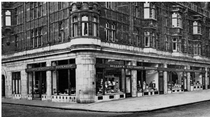
Figure 5 A picture of Dillons University Bookshop

a bookshop of the traditional dark and musty atmosphere would be horrified by Dillon's. It has lightly painted walls and beautiful, soft-coloured Lundia wood shelving. Contemporary light fittings and elegant modern staircases complete the picture of a colourful fresh place in which to peruse books quietly and at leisure. 283