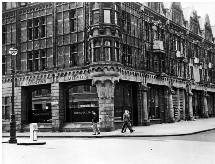
Figure 4 Image of Torrington Place Shops, year unknown