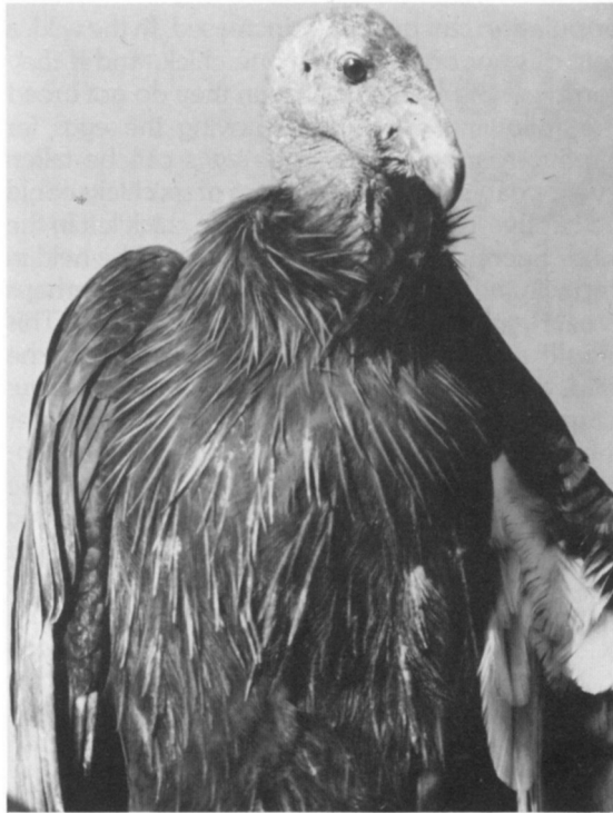
Californian condor.