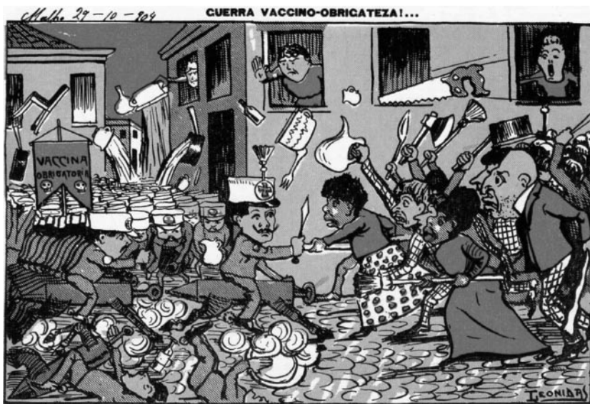
Figure 1: 'War against the compulsory vaccination!', published 29 October 1904, Revista O Malho , reproduced in Edgard de Cerqueira Falcão, Oswaldo Cruz monumental histórica. A incompreensão de uma época. Oswaldo Cruz e a caricatura , vol. VI, t. I., São Paulo, s.n., 1971 (Coleção Brasiliensia Documenta), p. CXXIX.

Once the most turbulent period was over, smallpox vaccination continued to be implemented and was slowly incorporated into the daily life of the capital and in the other main cities in the country. Mortality swiftly declined, reaching almost zero in 1906. The vaccination campaigns initiated by Oswaldo Cruz in 1904 had an important role in the decrease of smallpox cases for two subsequent decades, although a few important outbreaks interrupted the trend. For example, a new epidemic paralysed the capital in 1908, only four years after the Vaccine Revolt, causing an unusually high mortality rate of 1,000 per 100,000 inhabitants; a total of 9,900 cases was registered, surpassing the epidemic outbreaks of 1887 and 1891. 23 Nevertheless, there are no records of popular organized resistance to vaccination in 1908 nor in the outbreaks of 1914 nor in 1926, when the last epidemic struck Rio with over 4,140 reported smallpox cases. 24