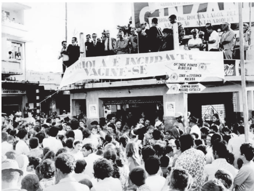
Figure 4: Politicians, officers and public health staff at the opening of the Smallpox Eradication Campaign, city of Natal, state of Rio Grande do Norte, north-east of Brazil, 1970.

National Epidemiological Surveillance System (Sistema Nacional de Vigilância Epidemiológica) established formally in 1975. 89