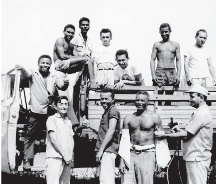
Figure 3: Vaccination of seasonal rural workers, state of Maranhão, north-east of Brazil, 1969.

simultaneously with mass vaccination activities and then continue after the attack phase had been completed. 86 However, as a result of financial and operational difficulties, an epidemiological surveillance system was not implemented until 1969, when the number of reported cases reached the highest level since the beginning of the smallpox campaign in 1966. The lack of good surveillance was reported to PAHO/WHO as a major barrier to eradication. 87 After the creation of Epidemiological Surveillance Units (Unidades de Vigilância Epidemiológicas) and Reporting Posts (Postos de Notificação) at the end of the decade, the data problem began to recede. These new surveillance functions became the responsibility of each state in the consolidation phase of the campaign, reinforcing the link among different governmental spheres. 88 By 1970 every state in Brazil had established an Epidemiological Surveillance Unit, and there were 6,074 Reporting Posts covering 90 per cent of Brazil's municipalities. These represented the embryo of the