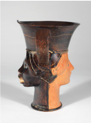
Figure 2.3a–c Janiform kantharos belonging to Class G of head vases, Attic red-figure ceramic, attributed to the London Class, c. 470 BCE. H. 20 cm, GR.2.1999.