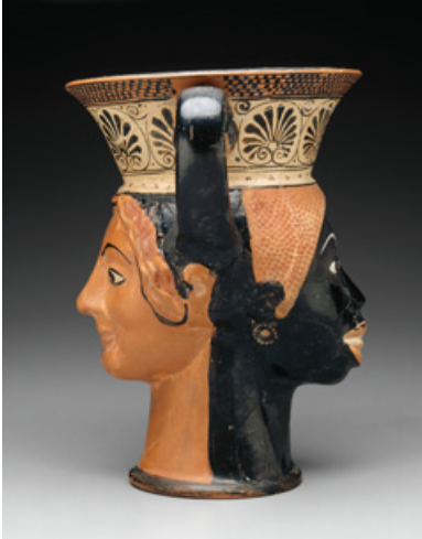
Figure 2.1a–c High-handled kantharos in the form of two heads, Attic black-figure ceramic, attributed to the London Class, c. 510–480 BCE. H. 19.2 cm, 98.926.