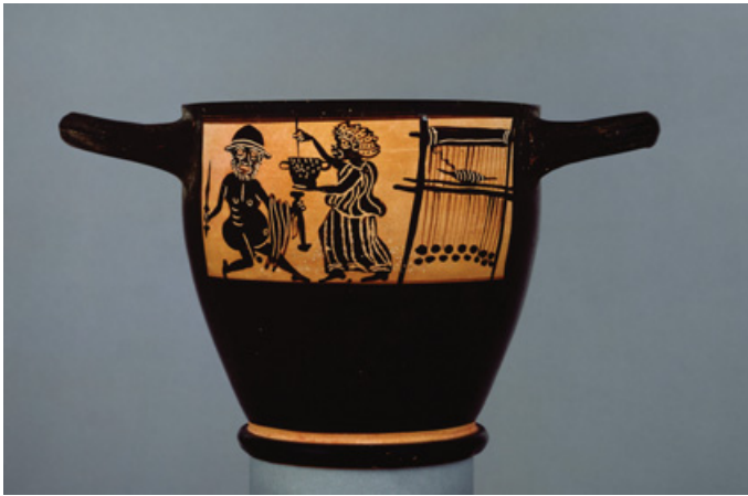
Figure 2.2 Skyphos depicting Odysseus at sea and with Circe, Boeotian black-figure ceramic, attributed to the Cabirion Group, c. fourth century BCE. H. 15.4 cm, AN1896–1908 G249.

An implicit call for restraint among wine-guzzling symposiasts also appears on scenes painted onto wide-mouthed cups ( skyphoi ) from the sanctuary of the Kabeiroi in Thebes (Boeotia). At this site, five of these cups recall a memorable scene from the Odyssey , in which the nymph Circe coaxes Odysseus to drink a potion that will transform him into a pig (10.302–47). 35 On one of these late fifth-/early fourth-century cups, both Circe and Odysseus are depicted as squat, black figures (Figure 2.2). Barring some fabric draped over his left arm and his brimmed hat, Odysseus is completely naked. His erect penis, pronounced nipples, and potbelly are on full display. Holding a sword in his right hand and its sheath in his left, he seems poised