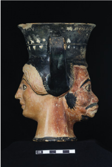
Figures 2.5a–c Kantharos with the heads of a young woman and a negro from Akanthos, Attic red-figure ceramic, c. 480–470 BCE. H. 18.6 cm. Archaeological Museum of Polygyros, I.D.Y. 8.