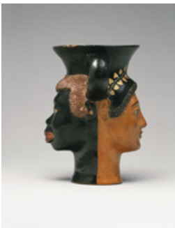
Figure 2.4a–c Janiform kantharos with addorsed heads of a male African and a female Greek, Attic red-figure ceramic, attributed to the Princeton Class, c. 480–470 BCE. H. 14.9 cm, 33.45 (y1933–45).

When the drinker lifts the cup, he or she subsumes this role of actor. The depiction of two faces fused onto one janiform cup simultaneously provokes and cuts across any permanent hierarchy of color that viewers may be tempted to map onto Greek antiquity. Skin color works in tandem with other visual markers to serve as a mask for symposiasts. In the minds of modern viewers who are not aware of the ways that cultural conditioning can infiltrate their perspective, there may appear to be an imbalanced presentation of the different faces on these cups. The sharp lines that distinguish each face from the other may mislead them to perceive the