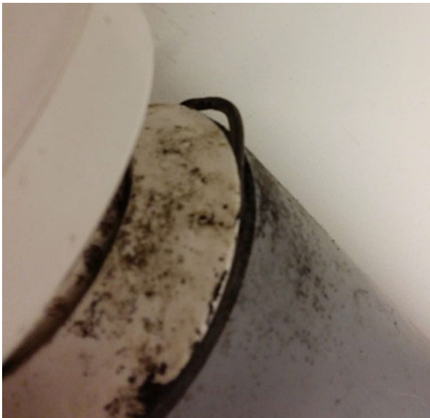
Fig. 3. Black smudge on the right-hand side on the neck of the valve where the valve was leaking.

cubes at a restaurant in the Pirkanmaa region of Finland. The ice cubes were most likely contaminated by air due to a leaking air ventilation valve located in the same room. The ice cube machines were closable, clean by visual inspection and the scoop was clean, although not in the appropriate storage location. Tap water tested negative for norovirus and was in closed tube system before reaching the ice cube machines, therefore considered an unlikely source. The washing machine and drier may have contributed