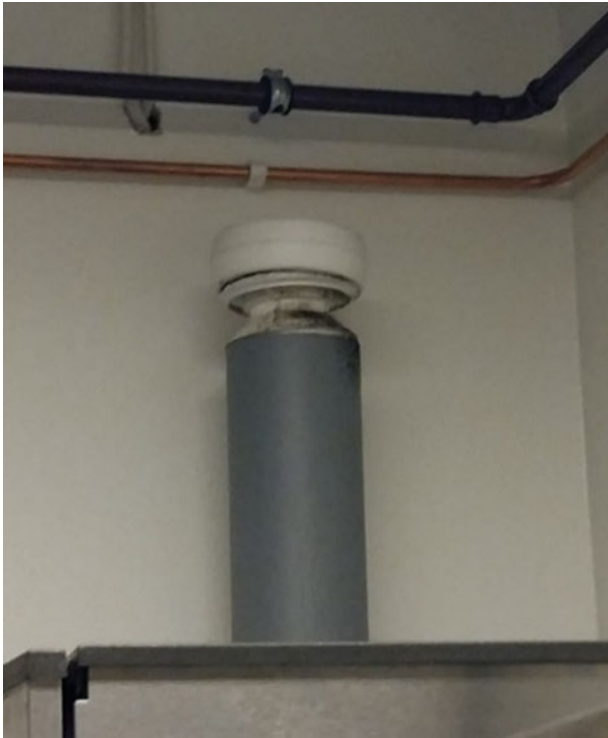
Fig. 2. The implicated white coloured air ventilation valve and its grey connecting ventilation sink behind the ice cube machine.