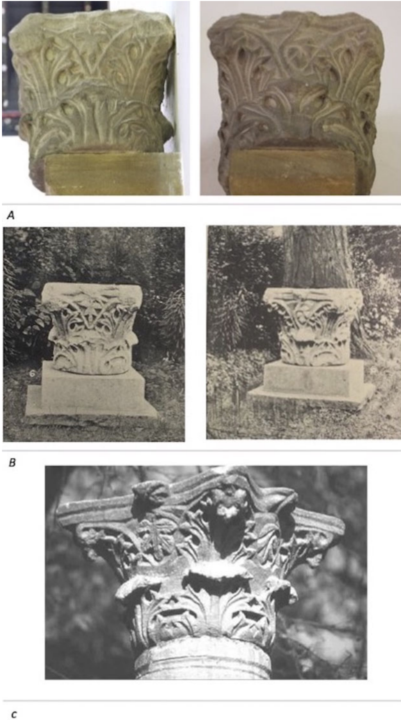
Fig 3. Lyre Capital from the Blachernai area and comparisons. A) Lyre Capital, Blachernai area, Constantinople, 5th-6th c., Lower Kingswood (Surrey), Church of the Holy Wisdom of God; B) Lyre Capital from the Blachernai area as it appears in Freshfield's Memorandum (1903); C) Lyre capital, 5th-6th c., Ayasofya courtyard (after Guiglia, Barsanti, Paribeni 2008).