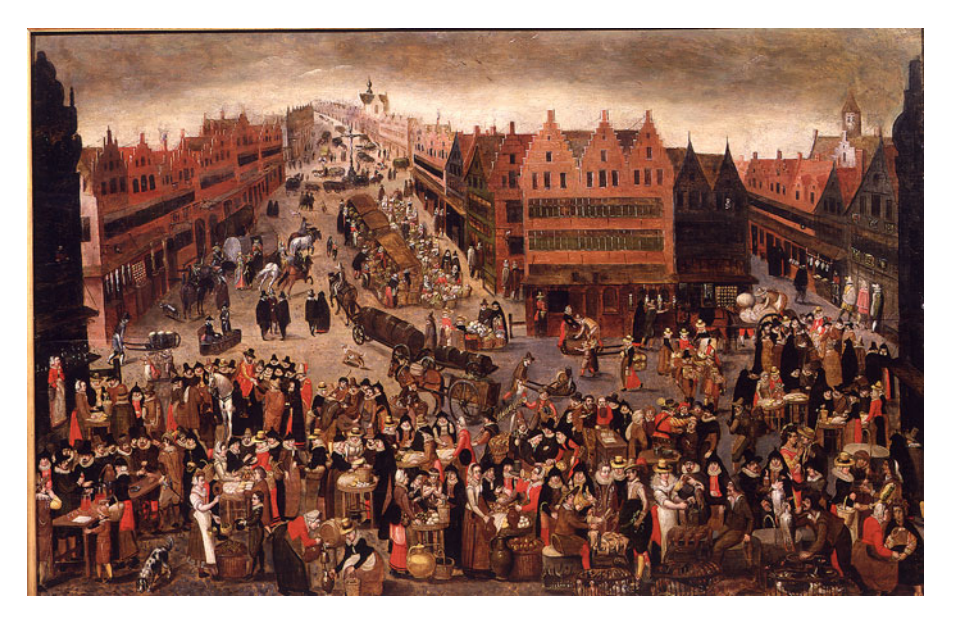
Figure 2. La place du Meir à Anvers, 1601–1700, oil painting, 90 x 140 cm, Musées royaux des Beaux-Arts de Belgique, Brussels (Institut royal du Patrimoine artistique – IRPA).

incompatible with horse and carriage traffic. Streets were not built for this purpose, hence the mobility issues, as illustrated in a painting depicting Meir in Antwerp (Figure 2).