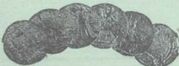
Gold Medal Allahabad 1910.

Paris 1900, Brussels 1910, Buenos Aires 1910.