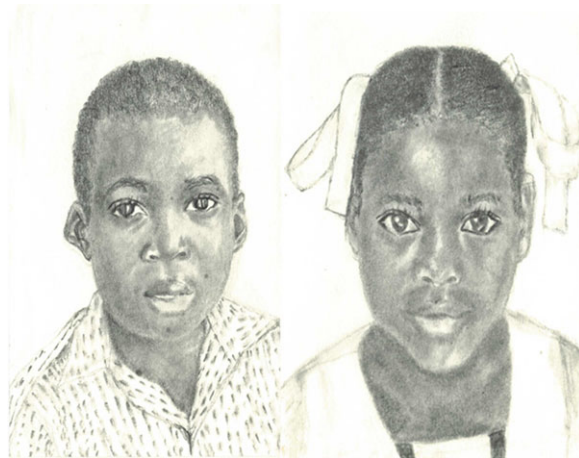
Figure A1. Sample stimuli from the Face-Name Binding Test (FNBT).

When designing the overall cognitive test protocol, we selected NEPSY-II subtests to assess the convergent and divergent validity of GLAMS subtests. Given the limited attention spans of preschool children, we prioritized subtests that were quick, simple to administer across various contexts (clinics, schools, homes) and considered culturally appropriate by Grenadian members of the study team. To assess convergent validity, we considered all of the preschool memory domain subtests from the NEPSY-II. There were concerns raised about the cultural familiarity and administration time/burden of the Narrative