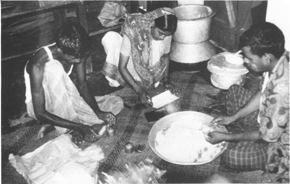
Plate 4 (a): Bengalis in Matlab mix the ingredients for oral rehydration solution and put them in small plastic packets for community distribution.