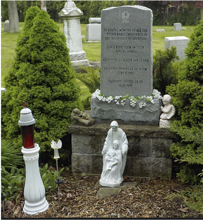
Figure 4. Grave of the unborn fetus (1973), Church of the Assumption Grotto.

and French origins. Interestingly, the grotto and the church grounds sit on a World War I and World War II German military cemetery.