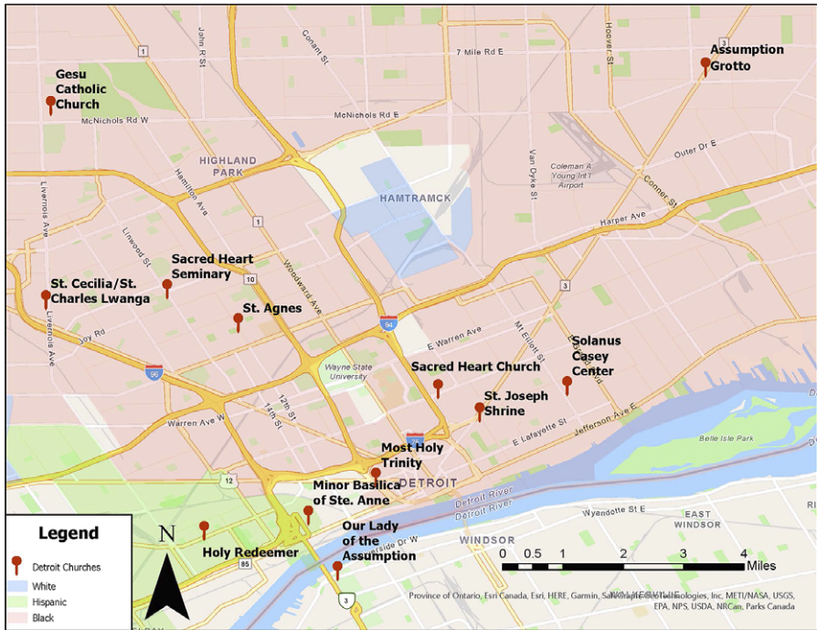
Figure 3. Map showing churches discussed in the text in relation to predominant race reported for 2010 census tracts. Census data downloaded from datadrivendetroit.org .