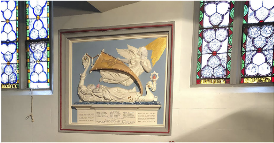
Figure 5. Holy Trinity Church.