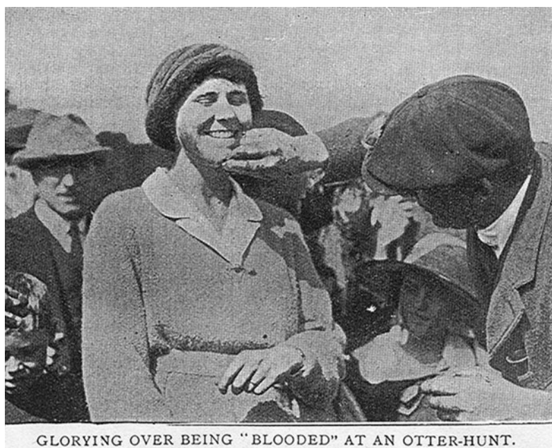
Figure 4. 'Glorying over being "blooded" at an Otter Hunt', Cruel Sports , 1928 p. 85.

but are more decent than the hunters, who are by contrast portrayed as disreputable, aggressive and shameful.