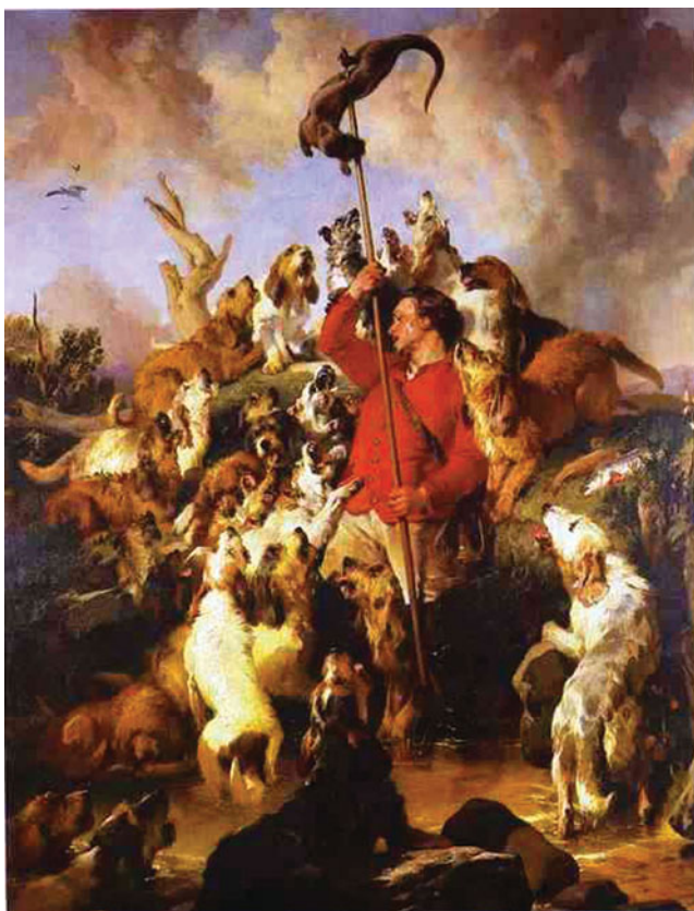
Figure 1. Sir Edwin Landseer, The Otter Speared, Portrait of the Earl of Aberdeen's Otterhounds, or the Otter Hunt , 1844; Laing Gallery, Newcastle http://www.twmuseums.org.uk/laing-art-gallery/collections.html .

John Mackenzie points out that Landseer did not 'decry human participation in the raw cruelty of the natural world. Human involvement is, rather, glorified as an imperative of command over nature, perfectly conveyed in The Otter Hunt .' 3 Ruskin's critique of the painting did little to diminish the popularity of Landseer's art in the nineteenth century and hunts, hunters and otter hunting increased substantially in popularity, reaching a peak in the Edwardian period. 4 The fifteen hunts in existence in 1880 had grown to twenty-two by 1910. 5 Spearing was no longer permitted in the popular modern form. Mr Collier's Otter Hounds were the last to abandon the spear in 1884, 'as his field did not care to see so gallant a beast suffer such an end'. 6 By the twentieth century most otter hunters spoke of the 'remote and barbarous days of the spear', 7 and broadly disregarded spearing as one of the 'blood-thirsty methods used by our forefathers'. 8 The seasonality, setting and pedestrianism of otter hunting appealed to Edwardian sporting and leisure sensibilities. Summer hunting across rugged river valleys offered strenuous physical exertion in the sun, whilst facilitating a picnic and a paddle. Otherwise inaccessible wild and watery landscapes could also be explored: 'in otter hunting, the hounds, the invigorating air of