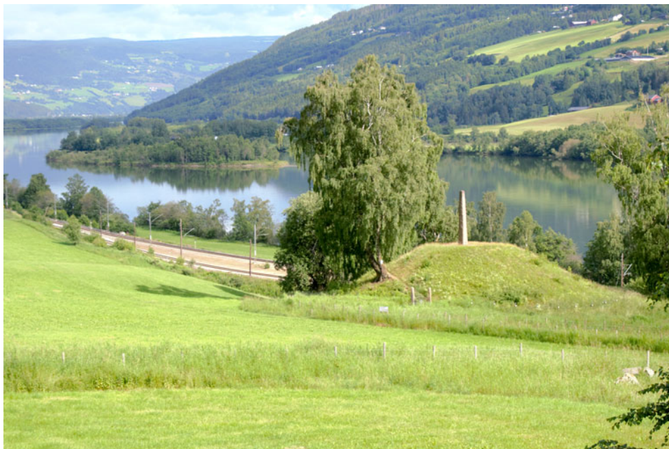
Figure 1. The southeast of central lowland Sør-Fron, seen from the north-eastern mound at Hundorp. The mound to the right is the easternmost mound at Hundorp. The obelisk on the mound was raised in 1907.

purpose of Schøning's journey. There are indeed many mounds known from later sources that Schøning never described and that he probably never visited, such as the cluster at Kjørstad (see Figure 2). The seven clusters that Schøning describes are thus not all the local mound groups; Schøning's clusters and the cluster at Kjørstad are merely a minimum number of clusters that had survived by 1775. Allowing for the possibility that mounds had been demolished not just after but also before the 1770s suggests that some of the clusters observed in 1775 were once part of a continuously monumentalized landscape with no clearly defined centre. Hypothetically, some of the mounds in Sør-Fron could have been built at the command of elites, but if we were to interpret all these clusters as centres of dynastic power, we would be left with a myriad Late Iron Age dynasties of chiefs