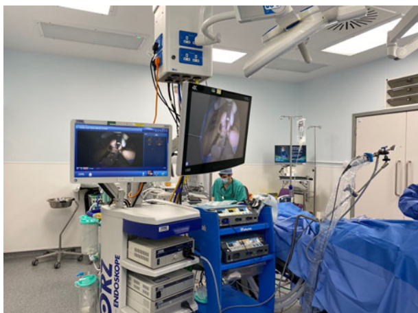
Figure 1. Operative set-up.