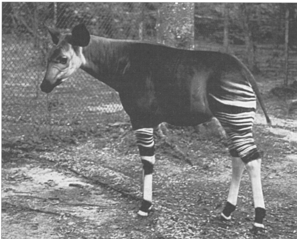
The okapi Okapia johnstoni , a forest giraffe endemic to Zaïre, which is protected by the Okapi Wildlife Reserve (WWF/P. J. Stephenson).

continuing political instability in Zaïre, which often makes law enforcement impossible. If the human population around the reserve continues to expand, it will place an ever-increasing demand on natural resources and reduce the likelihood of rational use.