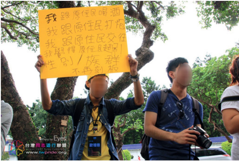
Figure 25 Taiwan LGBT+ Pride 2014.