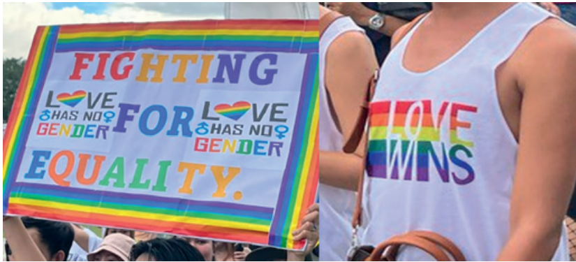
Figure 6 Signs that represent global LGBTQIA+ discourses.

reflect local engagement with global LGBTQIA+ discourses of visibility, tolerance, and diversity.