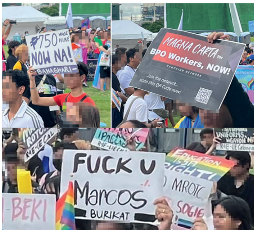
Figure 8 Signs that present socioeconomic calls.

The first image in Figure 8 (top-left) conveys a demand for a higher minimum wage. The sign presents an imperative in Taglish (i.e., English