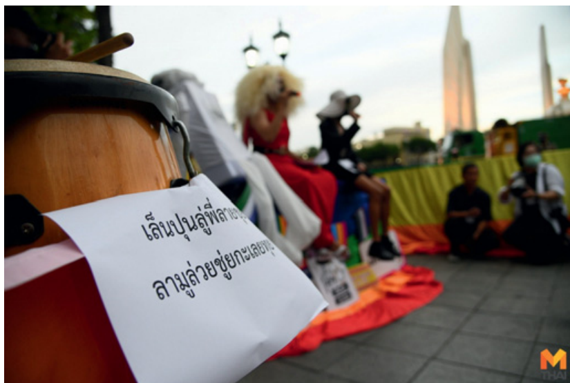
Figure 5 “I am a man who comes to assist kathoe y” (Mono News, 2020).

identified as men. This highlights the usage of another linguistic tool associated with the kathoe y identity. It emphasizes the prevalence of kathoe y and showcases the involvement of a non-LGBTQIA+ identity playing a supporting role within the LGBTQIA+-led movement.