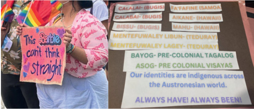
Figure 7 Signs that represent sexual identities.

identifications. One such instance is observed in the first sign (Figure 7, left), bearing the message “This Barbie can’t think straight.” This sign deploys intertextuality as a tool to convey its message, referencing the online promotional campaign associated with the Barbie movie franchise (i.e., the phrase “This Barbie . . .”) (Hodges, 2015). This intertextual linkage bridges the mainstream media with LGBTQIA+ representation, which aids in embedding LGBTQIA+ identities through recognizable forms of popular culture. Moreover, by invoking Barbie, a symbol of heteronormative feminine ideals and traditional gender roles and juxtaposing it with the evaluation “can’t think straight,” this sign disrupts the heterosexual expectations and assumptions. By adopting the name and typography of the Barbie logo, the sign aligns itself with dominant culture – specifically, a commodified notion of heterosexual femininity and womanhood – while simultaneously creating a paradox by acknowledging nonheterosexuality. This discursive move transforms the sign into a tool for disruption, celebrating the deviation from normative expectations.