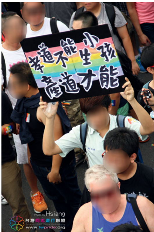
Figure 17 Taiwan LGBT+ Pride 2014.