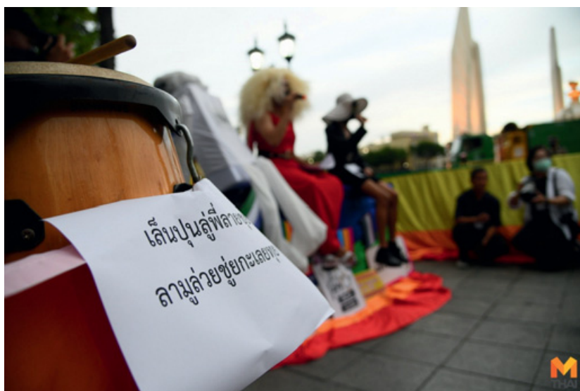
Figure 5 “I am a man who comes to assist kathoey ” (Mono News, 2020).

identified as men. This highlights the usage of another linguistic tool associated with the kathoey identity. It emphasizes the prevalence of kathoeyness and showcases the involvement of a non-LGBTQIA+ identity playing a supporting role within the LGBTQIA+-led movement.