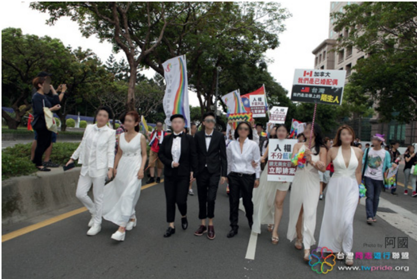
Figure 12 Taiwan LGBTQIA+ Pride 2014.

men's suit in the nineteenth century, Alfredsson and Augustsson (2017) point out that the so-called men's suit emerged in the late nineteenth and early twentieth centuries. It was characterized by three pieces: an ensemble of a jacket, waistcoat, and pants made in the same or similar fabric for mass production. The three-piece ensemble can also be observed in modern suits and tuxedos worn by men. Conversely, women's attire was crafted in a more elaborate style due to their comparatively lower societal influence relative to men's in the nineteenth century. The opulence observed in women's attire during the nineteenth century is also reflected in the gowns worn by women in contemporary societies. In light of the above, it can be posited that the two types of femininity depicted in Figure 12 exemplify the traditional gender binary of male and female.