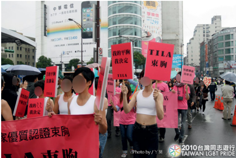
Figure 20 Taiwan LGBT+ Pride 2010.