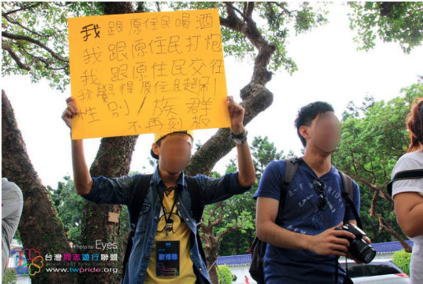
Figure 25 Taiwan LGBT+ Pride 2014.