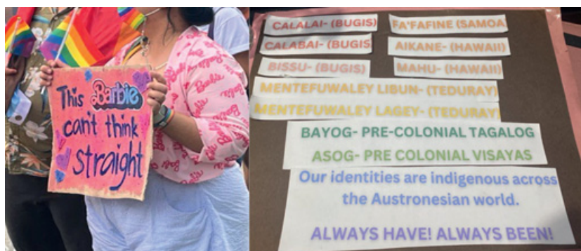
Figure 7 Signs that represent sexual identities.

identifications. One such instance is observed in the first sign (Figure 7, left), bearing the message “This Barbie can’t think straight.” This sign deploys intertextuality as a tool to convey its message, referencing the online promotional campaign associated with the Barbie movie franchise (i.e., the phrase “This Barbie . . .”) (Hodges, 2015). This intertextual linkage bridges the mainstream media with LGBTQIA+ representation, which aids in embedding LGBTQIA+ identities through recognizable forms of popular culture. Moreover, by invoking Barbie, a symbol of heteronormative feminine ideals and traditional gender roles and juxtaposing it with the evaluation “can’t think straight,” this sign disrupts the heterosexual expectations and assumptions. By adopting the name and typography of the Barbie logo, the sign aligns itself with dominant culture – specifically, a commodified notion of heterosexual femininity and womanhood – while simultaneously creating a paradox by acknowledging nonheterosexuality. This discursive move transforms the sign into a tool for disruption, celebrating the deviation from normative expectations.