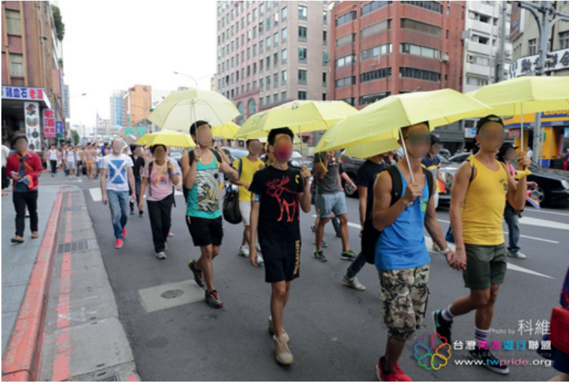
Figure 30 Taiwan LGBT+ Pride 2014.