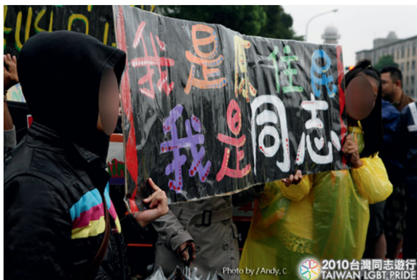
Figure 24 Taiwan LGBT+ Pride 2010.