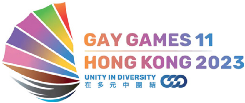
Figure 34 Gay Games 11 logo.

The logo for the Hong Kong Games (Figure 34) depicts a Chinese sampan , a type of traditional sailing vessel associated with the iconic Victoria Harbour, its customary red sail replaced in this design by a rainbow sail, the symbol of the LGBTQIA+ movement. In this way, the logo functions semiotically to represent the crossing of the Gay Games brand into new spaces, as it travels from West to East.