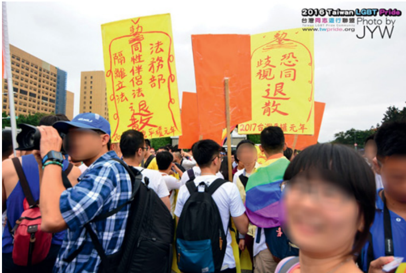
Figure 27 Taiwan LGBT+ Pride 2016.