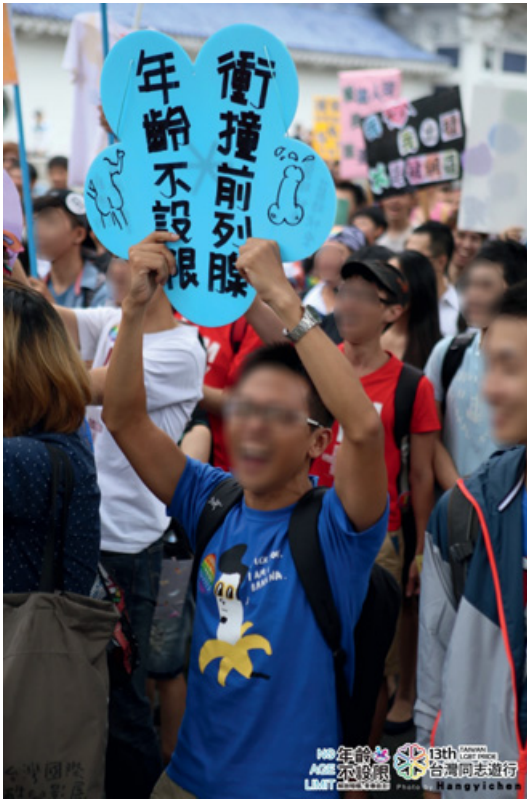
Figure 15 Taiwan LGBT+ Pride 2015.