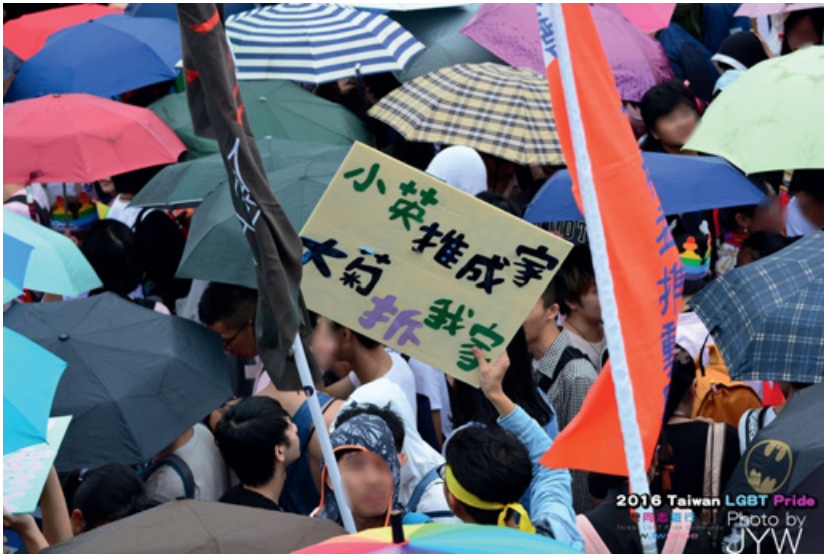
Figure 32 Taiwan LGBT+ Pride 2016.