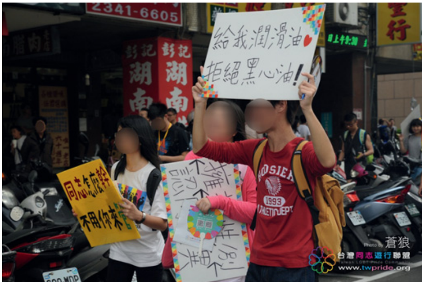
Figure 14 Taiwan LGBT+ Pride 2014.