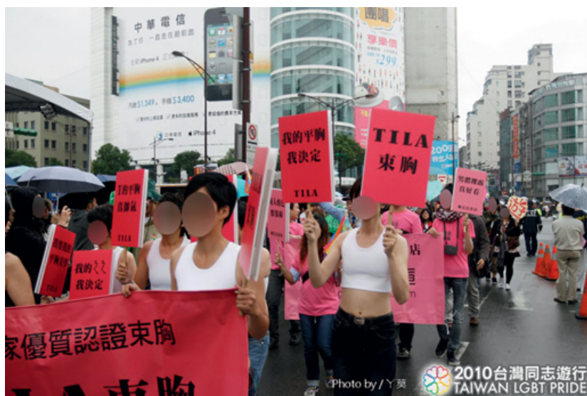
Figure 20 Taiwan LGBT+ Pride 2010.