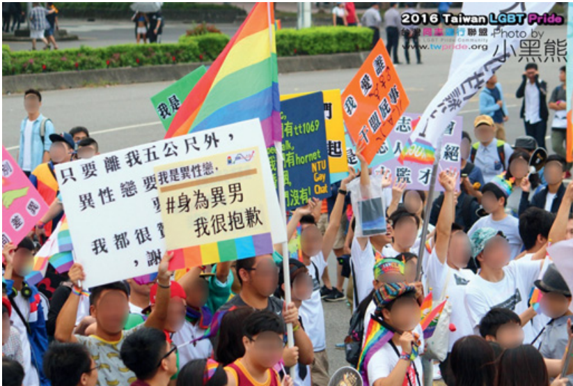
Figure 23 Taiwan LGBTQIA+ Pride 2016.