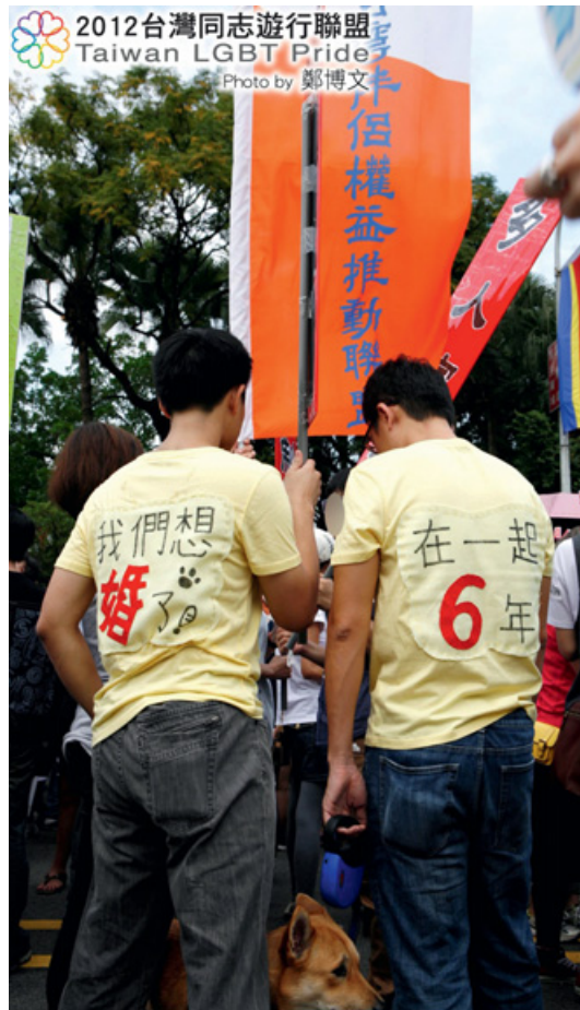
Figure 10 Taiwan LGBT+ Pride 2012.