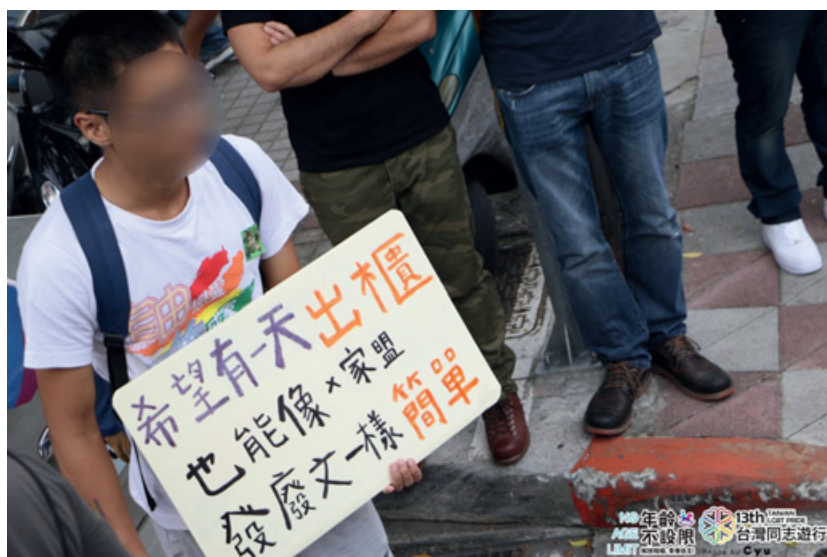
Figure 33 Taiwan LGBT+ Pride 2015.

As shown in Figure 33, humor is utilized as a means to criticize organizations (or individuals) in Taiwan who are unfriendly toward the LGBTQIA+ community. Specifically, the Family Guardian Coalition (Hùjiāméng), which is composed of various religious groups that oppose same-sex marriage legislation, is mocked in a humorous manner. While an “x” is perhaps used to protect the confidentiality of the Family Guardian Coalition, the LGBTQIA+ community in Taiwan is aware of the targeted group. The substitution of “x” for “hù” in order to maintain confidentiality (i.e., x-jiāméng ) may serve to strengthen in-group solidarity, as this practice assumes that all members of the Taiwanese