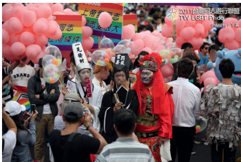
Figure 28 Taiwan LGBT+ Pride 2011.

Kui, traditionally known as the vanquisher of ghosts and evil beings. Although the three figures are from China, they are worshiped in temples and shrines in Taiwan and have become local gods. In Figure 29 , the marcher was also dressed as Prince Nezha, a protective deity in Chinese folk religion who is also known as the Marshal of the Central Altar or as the Third Prince in Taiwan. Interestingly, the marcher's costume and the rainbow flag interact to signal the harmony between Taiwanese localism and global queerness. Although the Pride marchers were dressed as figures from Chinese folk religion, their costumes show that Taiwan is a melting pot of cultures. More specifically, Taiwan's diversity, as reflected in its multilingual, multiethnic, and multicultural environment, is how tai -ness is embodied.