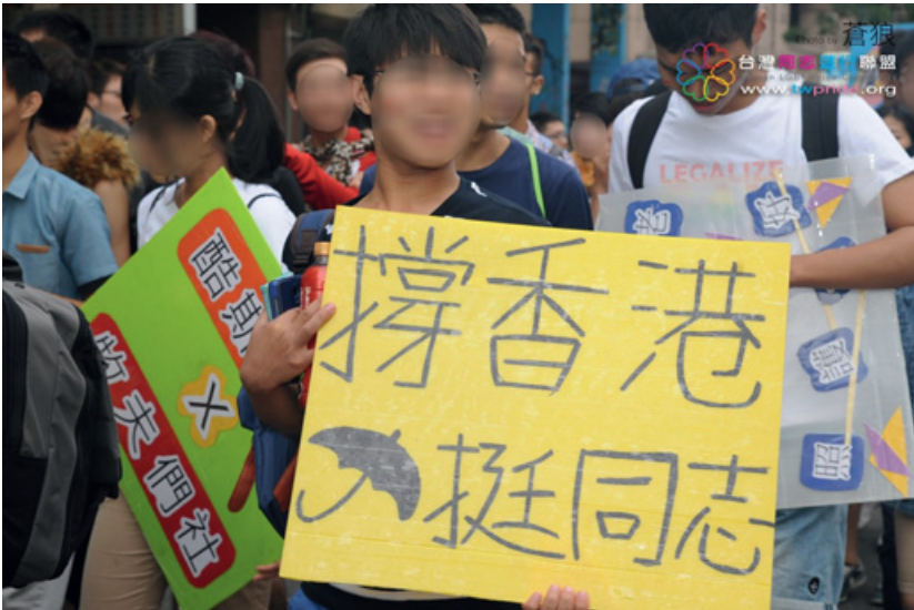
Figure 31 Taiwan LGBT+ Pride 2014.