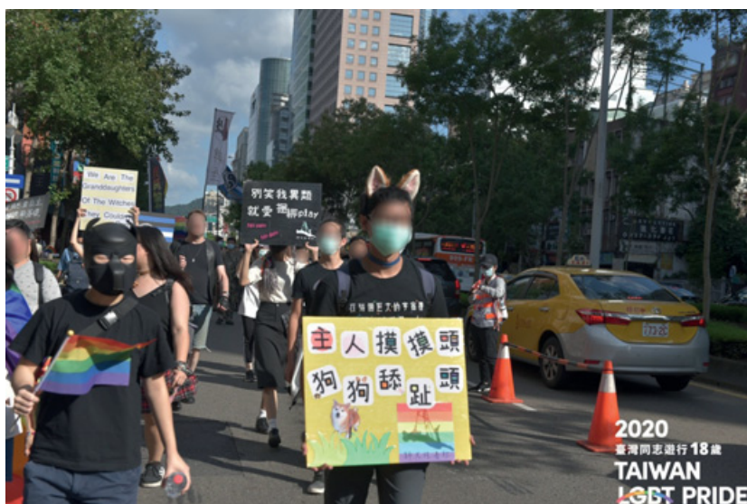
Figure 16 Taiwan LGBT+ Pride 2020.