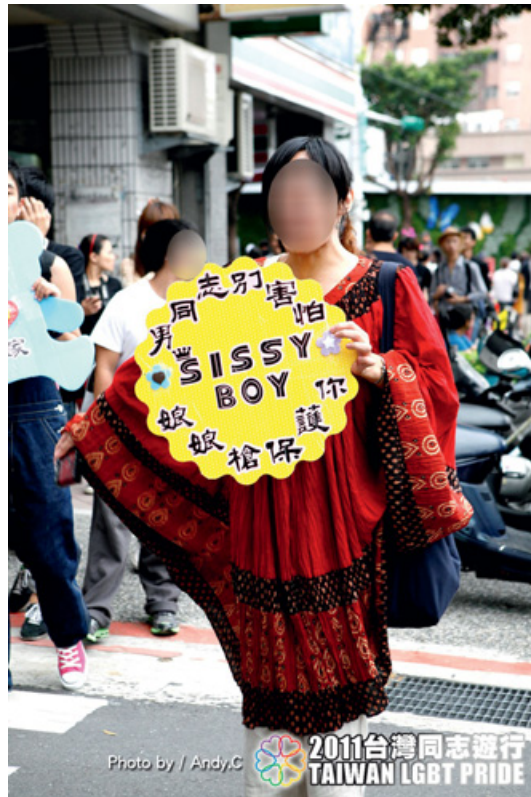
Figure 22 Taiwan LGBT+ Pride 2011.

Figure 22 shows this new form of masculinity, i.e., feminine masculinity, as evidenced by the derogatory term, niángniángqiāng “sissy boy; sissy-gun” and the verb, bǎohù “to protect.” While 娘娘槍 niángniáng-qīāng “sissy-gun” is the play