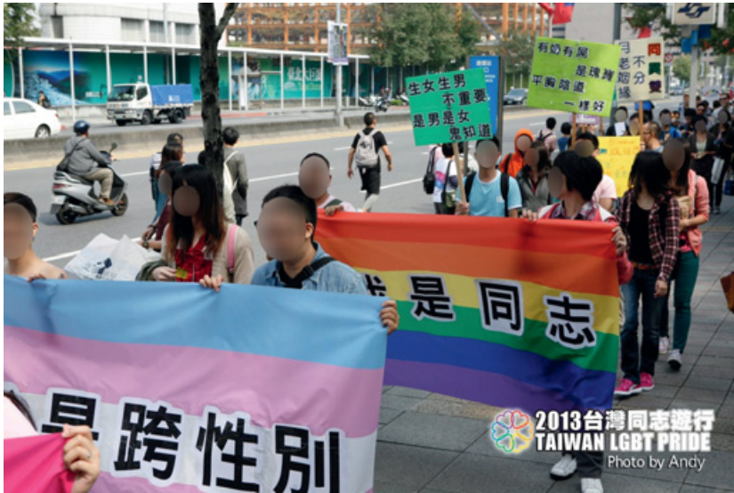
Figure 18 Taiwan LGBT+ Pride 2013.