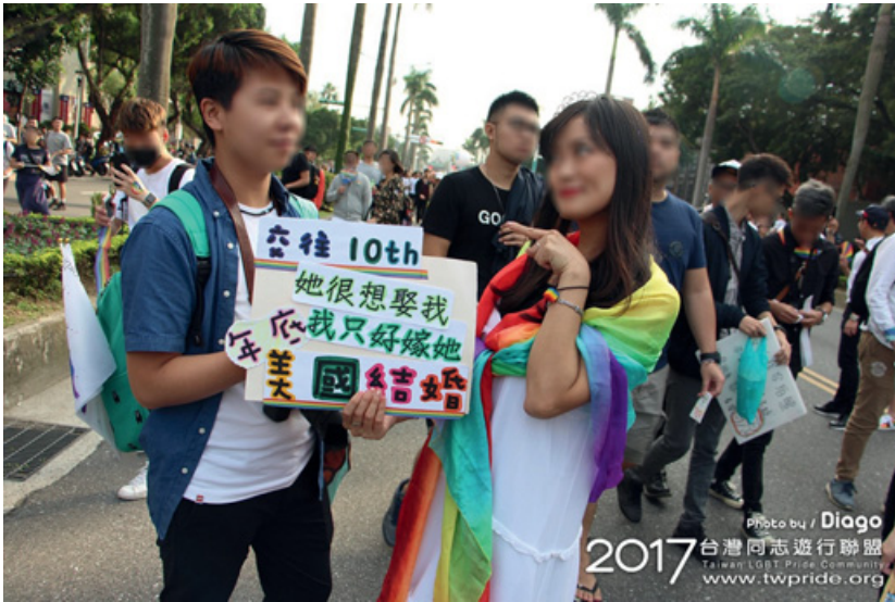
Figure 11 Taiwan LGBT+ Pride 2017.