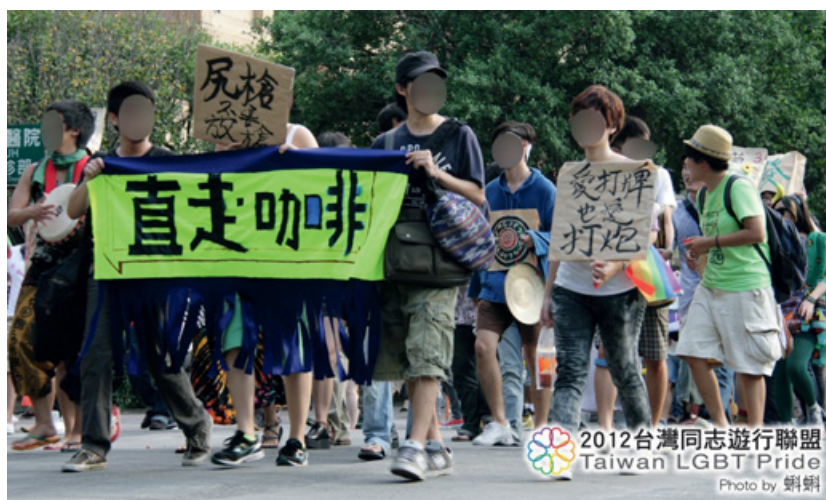
Figure 13 Taiwan LGBT+ Pride 2012.