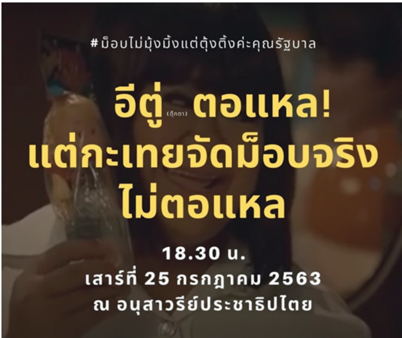
Figure 2 “Tu (the doll), you liar! But kathoey will really lead a protest, not liars here” (Raptor eng cha, 2020).