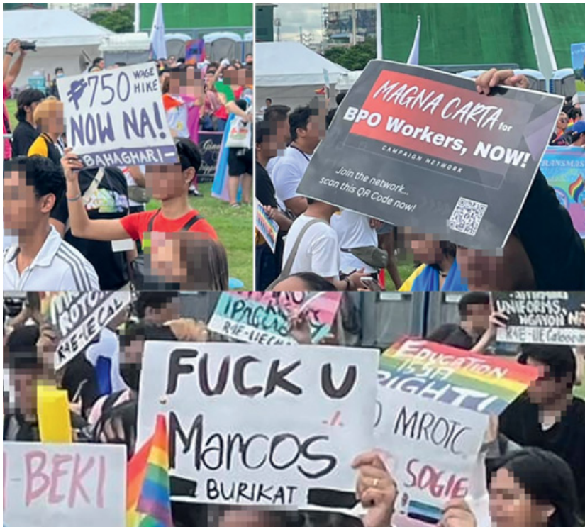
Figure 8 Signs that present socioeconomic calls.

The first image in Figure 8 (top-left) conveys a demand for a higher minimum wage. The sign presents an imperative in Taglish (i.e., English