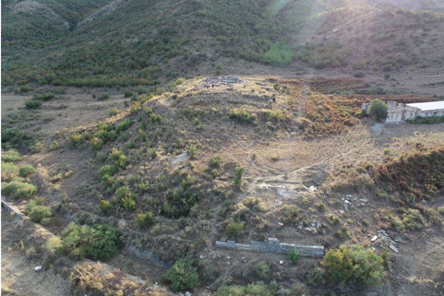
Fig. 7.6. The Hellenistic lower site and the upper and residential complex at Dobra.