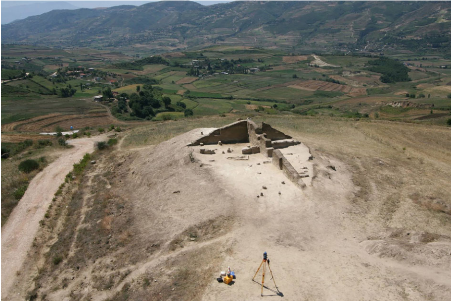
Fig. 7.3. The excavated tumulus at Lofkënd.

mosaic floors and inscriptions. In the later sixth century, the settlement was abandoned (Muçaj et al. 2019).