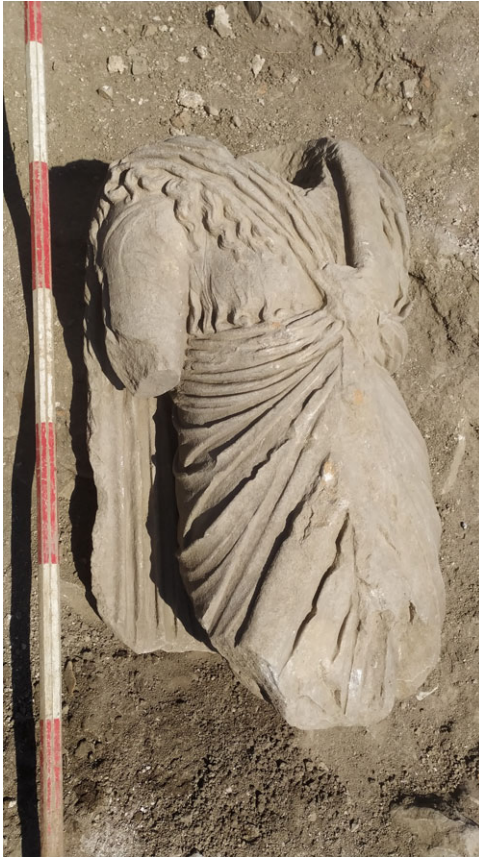
Fig. 7.5. Phoinike sculpture of Isis from the Roman layers.