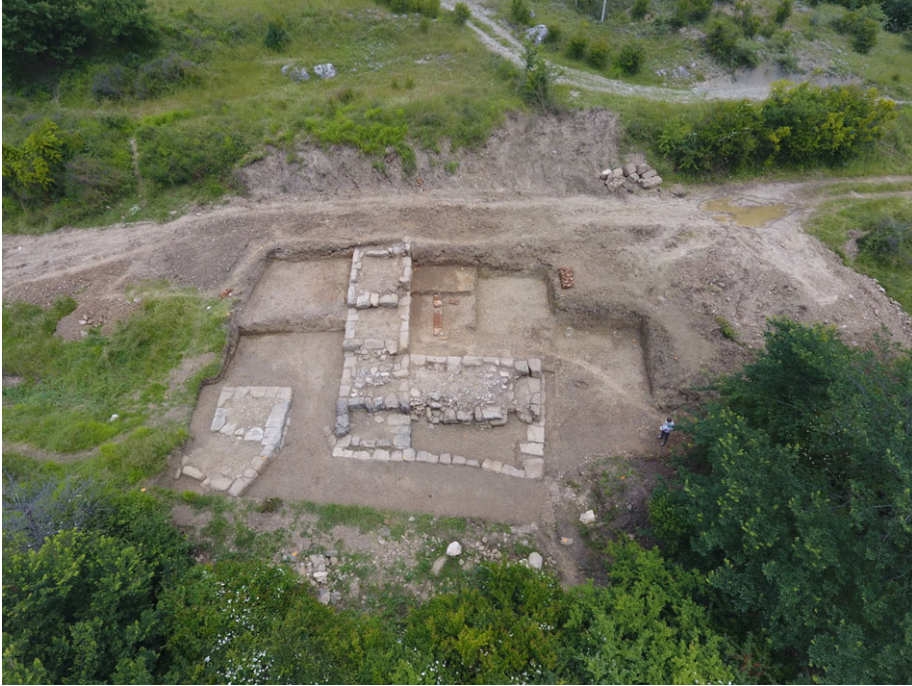
Fig. 7.1. Bushat, aerial photo of the city gate protected by a tower.

The mortuary landscape similarly worked to integrate hillfort communities rather than separate them.