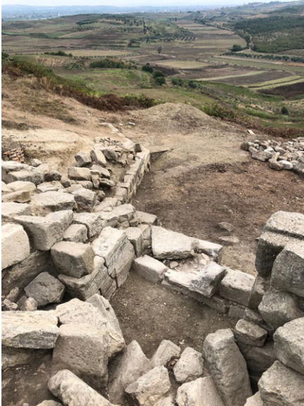
Fig. 7.2. Apollonia excavations of the northeast gate.