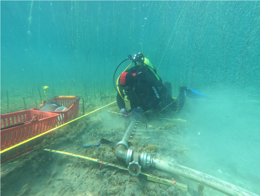
Fig. 7.4. The excavation of the prehistoric lake shore village of Lin 3 on Lake Ochrid.

partially resettled in the fifth/sixth centuries AD. Archaeological excavations undertaken in different sectors intra muros , brought to light important public monuments (Heinzelmann and Muka 2014), while extra-urban investigations revealed the presence of two different funerary areas (Muka and Heinzelmann 2014; 2016; Heinzelmann and Muka 2015; Muka, Heinzelmann and Schröder 2020).