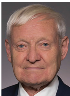
IFSM Symposium speaker Prof. Joachim Frank.

A highlight of IMC19, The IFSM Symposium, will take place on Friday September 14th and will include the presentation of IFSM Medal Awards for 2018, as well as special plenary lectures by the awardees. Prof. Joachim Frank, Nobel Prize winner and joint-winner of the Eduard Kellenberger Medal, will be presenting at the IFSM Symposium—an opportunity not to be missed. Prof. Frank is regarded as a co-founder of single-particle cryo-electron microscopy (cryo-EM), for which he shared the Nobel Prize in Chemistry in 2017 with Jacques Dubochet and Richard Henderson. He also made significant contributions to the structure and function of the ribosome from bacteria and eukaryotes. Prof. Frank will be joined by fellow IFSM Medal awardees who will each present an IFSM Medal Award Plenary Lecture.