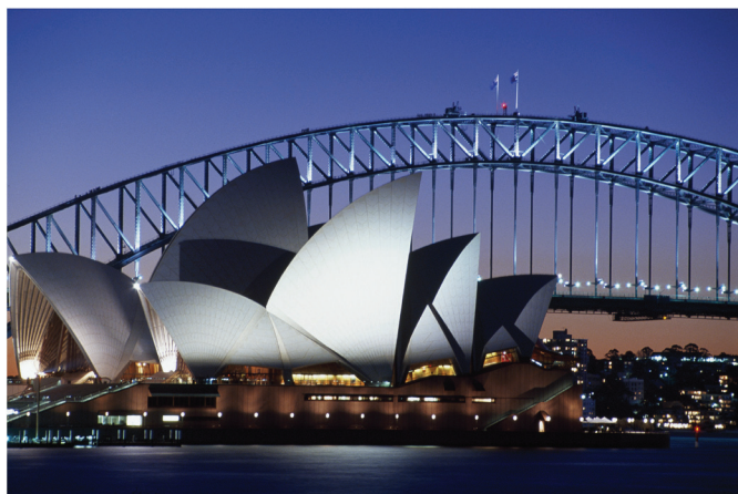
Sydney Opera House and Sydney Harbour Bridge at night.

For more information, please visit the Congress website at www.imc19.com .