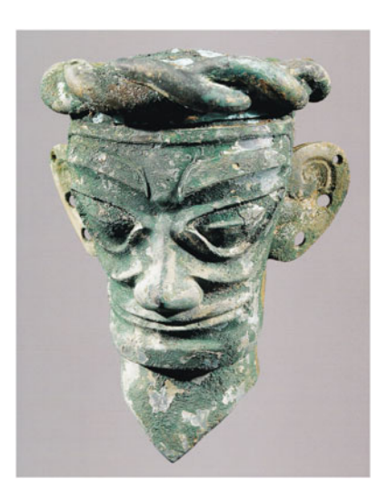
Figure 10. Bronze head thirteenth-twelfth century BCE, excavated from Sanxingdui Pit I, Guanghan Sanxingdui Site Museum, Sichuan.

swords suspended from their sides with a shoulder strap. There is an air of ceremonial formality to the scene, lending credence to the theory that this is a procession expressing fealty (Peters 2002: 95).