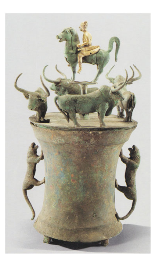
Figure 4. Bronze cowrie container showing scene of a rider with cattle, Western Han period (206 BCE–24 CE), excavated from Shizhaishan, Yunnan. Yunnan Provincial Museum, Kunming. Image reproduced with permission from the Yunnan Provincial Museum.