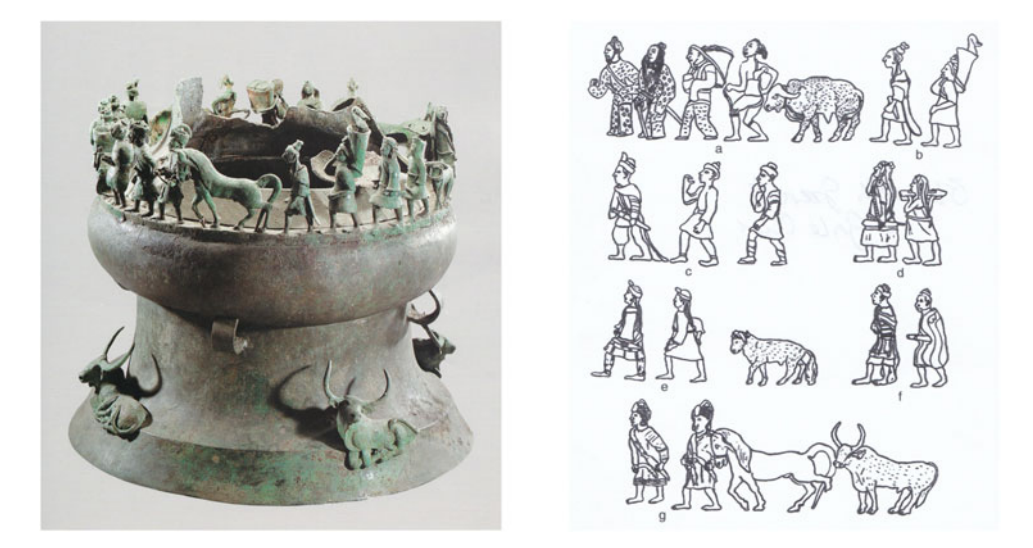
Figures 11a and 11b. Bronze cowrie container with scene depicting a procession of tribute bearers, with a line drawing showing detail, Western Han period (206 BCE–24 CE), excavated from Shizhaishan, Yunnan Provincial Museum, Kunming. Image reproduced with permission from the Yunnan Provincial Museum; line drawing by the author.