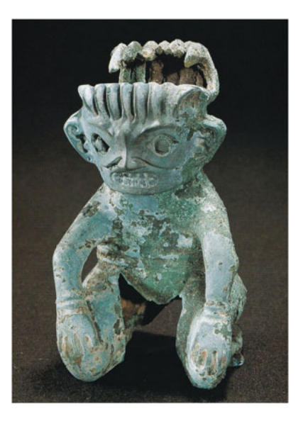
Figure 12. Bronze seated human figure, thirteenth-twelfth century BCE, Sanxingdui Pit I, Guanghan Sanxingdui Site Museum, Sichuan.

leading a bull (Figure 13). All three figures wear their hair in a similar fashion and are clothed in robes and wear striped cuffs, reminiscent of the Sanxingdui figure and suggestive that this type of hairstyle and attire may have been worn by a specific group of people over a long period of time.