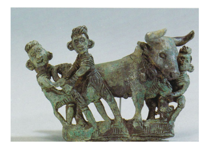
Figure 13. Bronze plaque with a scene showing three men and an ox, Warring States period (475–221 BCE), Yunnan Provincial Museum, Kunming.

particular group holds or plays at a particular period in time. What we can say about the variety of visual representations in the arts we have examined is that societies in the Southwest were made up of a rich mixture of peoples, even if their precise identification is not possible.