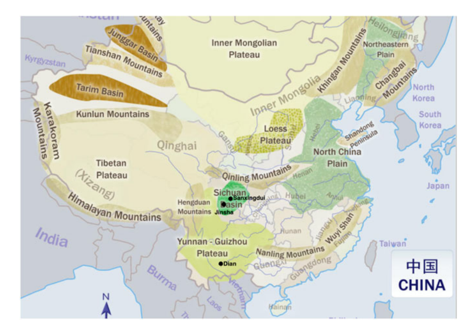
Figure 1. Map of the locations of the Sanxingdui, Jinsha and Dian cultures in early China

ritual vessels and paraphernalia in sacrificial pits. The Jinsha site, located on the outskirts of Chengdu, was discovered in 2001 and is considered the final phase of the Sanxingdui culture (Ye 2011). Finds from Jinsha have been dated to 1000–650 BCE by archaeologists, which corresponds to the Western Zhou period 西周 (eleventh century–770 BCE) (Chengdu Municipal Institute of Antiquity and Archaeology 2013). The Dian people were settled in the region of Lake Dian 滇池 in present-day Yunnan province, located south of Sichuan, and were active from around 500 BCE until 109 BCE, when they were conquered and attached as a vassal state to the Western Han Empire (202 BCE–9 CE) (Yao 2005: 381). Archaeological excavations at the two principal sites of Shizhaishan 石寨山 and Lijiashan 李家山 revealed them as a highly complex and localized kingdom with a society of significant traditions.