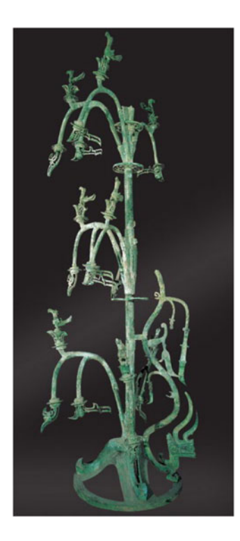
Figure 6. Bronze tree, twelfth century BCE, excavated from Sanxingdui Pit 2, Guanghan Sanxingdui Site Museum, Sichuan.