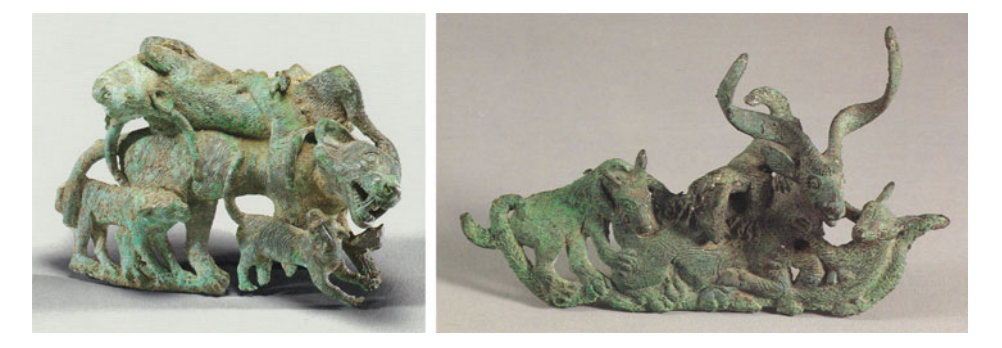
Figures 2 (left) and 3 (right). Bronze plaques depicting scenes of animal combat, Western Han period (206 BCE– 24 CE), excavated from Shizhaishan (left) and Lijiashan (right), Yunnan. Yunnan Provincial Museum, Kunming.