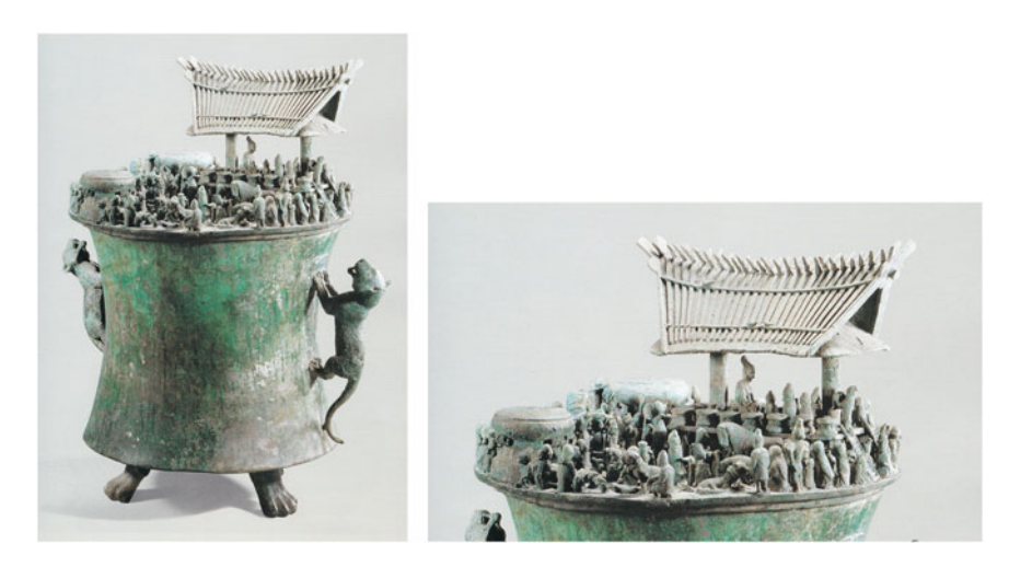
Figures 5a and 5b (detail). Bronze cowrie container with scene depicting a ritual offering, Western Han period (206 BCE–24 CE), excavated from Shizhaishan, Yunnan. Yunnan Provincial Museum, Kunming. Image reproduced with permission from the Yunnan Provincial Museum.