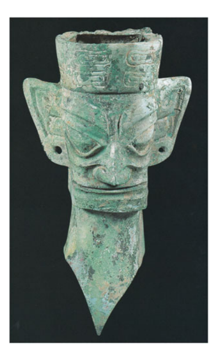
Figure 9. Bronze head, thirteenth–twelfth century BCE, Sanxingdui Pit I, Guanghan Sanxingdui Site Museum, Sichuan. Image reproduced with permission from the Sanxingdui Site Museum.