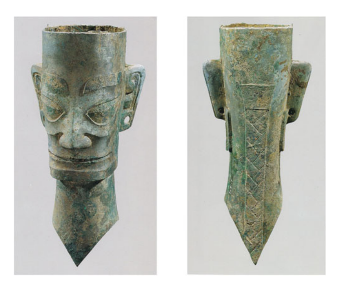
Figures 8a and 8b. Bronze head, twelfth century BCE, excavated from Sanxingdui Pit 2, Guanghan Sanxingdui Site Museum, Sichuan.