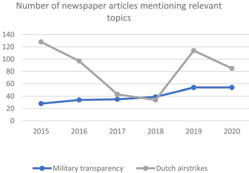
Figure 2. Count of Dutch newspaper articles mentioning military transparency and Dutch airstrikes (search terms: transparent* AND defensie; nederland* AND luchtaanval* OR luchtbombardement* ).

reporting. It also reiterated an investigation from the previous year by Airwars and Dutch broadcaster RTL that showed – based on Airwars data – that a Dutch aircraft had been implicated in a 2014 airstrike that had caused civilian casualties. Airwars did not do this in an unrestrained way, including a discussion of the ways in which transparency could be ensured without threatening operational security. 60