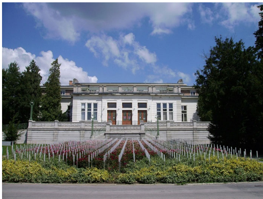
Fig. 1 Art Nouveau theatre and Spiegelgrund memorial. 2007. Muesse. Reproduced under a CC-BY license.

Harrowingly, over 750 child patients were murdered in Am Spiegelgrund. Others suffered fatal consequences from inhumane experimental procedures, including pneumoencephalographies, electroshock therapy and forced overdoses. 4,5 Death certificates were fabricated, and families would be requested to pay for their child's 'care'. 4 Nazi defeat saw Am Spiegelgrund's closure and punitive measures enacted for several psychiatrists complicit in the atrocities. 5 Yet, according to Neugebauer and Stacher, one of Am