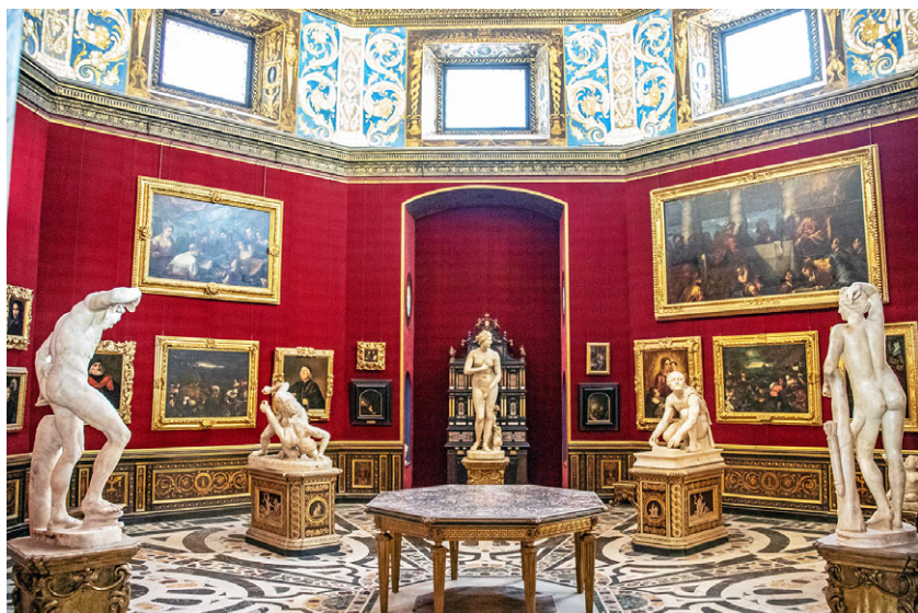
Figure 1.2 Bernardo Buontalenti, The Tribuna (1581–1583). The Wrestlers (deep left); Venus de' Medici (center); The Listening Slave (deep right). The Uffizi Gallery, Florence, Italy.

example of proportion, taken on tours in travel guides as a standard of excellence, and insistently included in novels and poems. 16