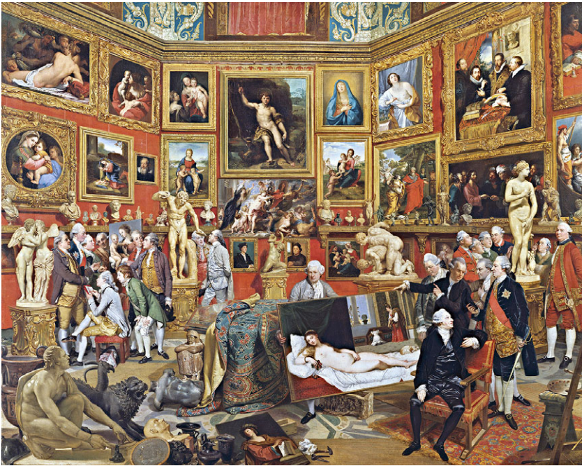
Figure 1.3 Johann Zoffany, The Tribuna of the Uffizi (1780). Courtesy of the Royal Collection Trust / © His Majesty King Charles III 2023.

composition that recreates some tourists' sense of being overwhelmed by the "folds within folds" as artistic styles and genres become close neighbors, and visiting connoisseurs crowd tightly in this aesthetic cul-de-sac . Millar interprets the painting as "a mixture of indefatigable industry, cupidity, self-seeking and imagination." 33 Rather than a literal depiction, Zoffany's Tribuna was, in Wolfgang Ernst's words, "a marvelous misreflection." 34 And yet The Morning Chronicle wrote in 1780 that "this