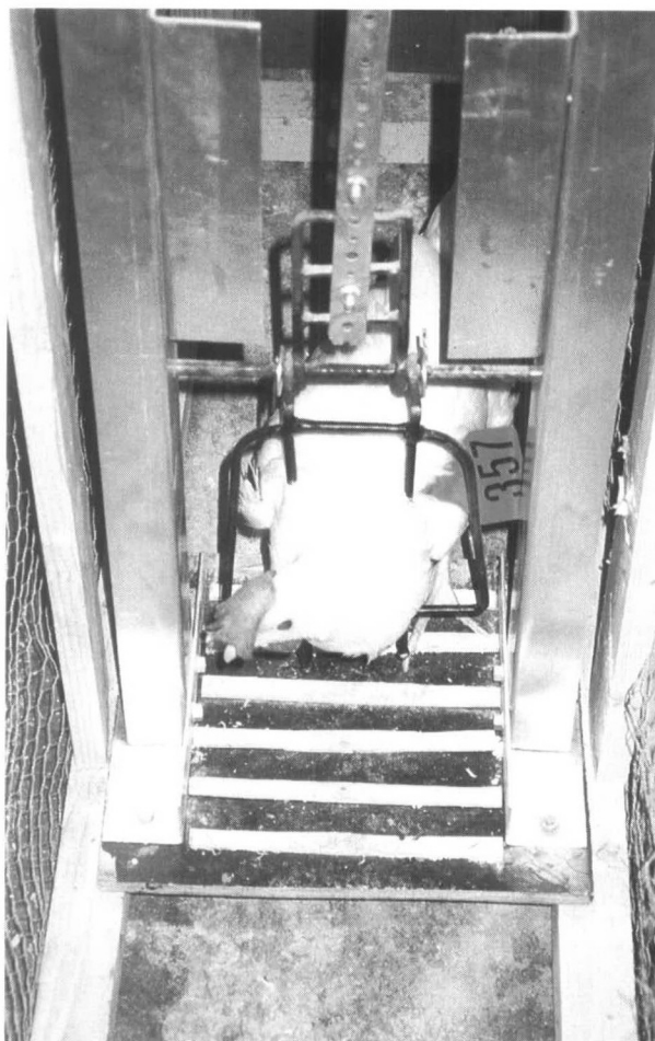
Figure 1 The push-door.

Failure to open the door was defined either as when the hen had tried for 7 min but had not managed to pass through, or as when she had made no attempts for 3 min. When a bird had failed, the experimenter opened the push-door and allowed the bird to reach the feeder. The bird was then given two trials at 20 per cent of the resistance she had just failed to open before finishing the session. We found that a hen's performance was considerably affected by the experience of a failure. When a bird was presented with a resistance 0.5 N lower than the one at which she had failed the preceding day, she responded with fewer door-push attempts and usually gave up without managing to open the door. The same also occurred when the resistance was decreased by a further 0.5 N two days after failing. After experiencing this with the four first birds in training, we adjusted the training method in order to encourage the hens to continue responding. Consequently, for the remaining four hens, on the day following a failure, the hen again received 20 per cent of the failed resistance for the first trial and then 40 per cent for trials two to four. On the second day after failing, the resistances were 40, 60, 80 and 85 per cent, and, on the third day, 85, 90, 95 and 100 per cent of the failed resistance, respectively, for trials one to four. We found that, despite this, three out of four birds never again reached the level at which they had first failed to open the door. To obtain a measure